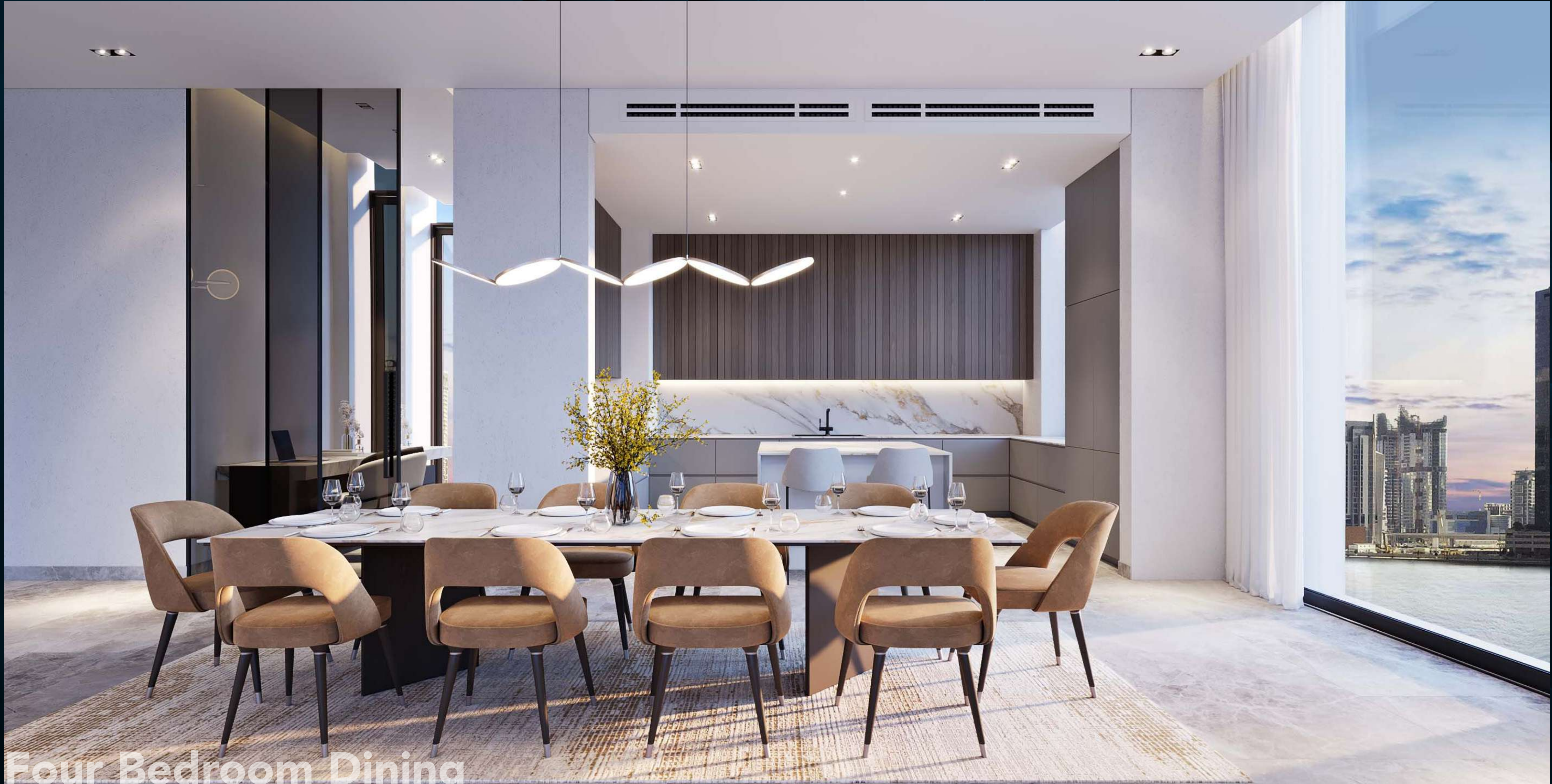
Four Bedroom Dining