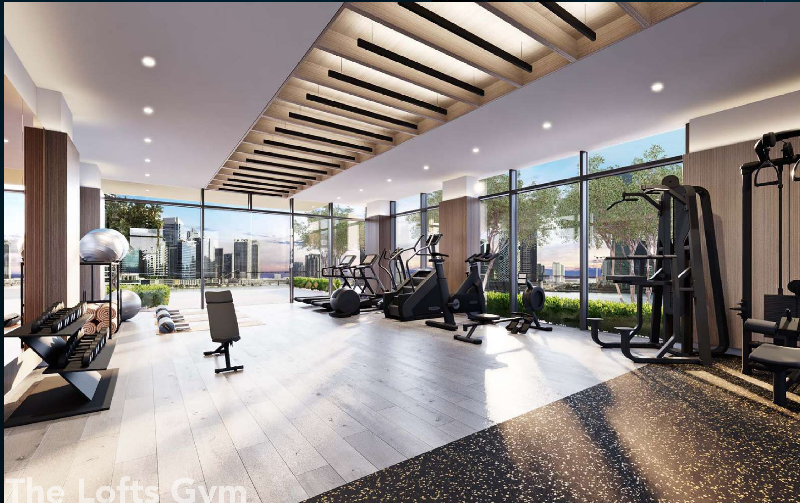
The Lofts Gym