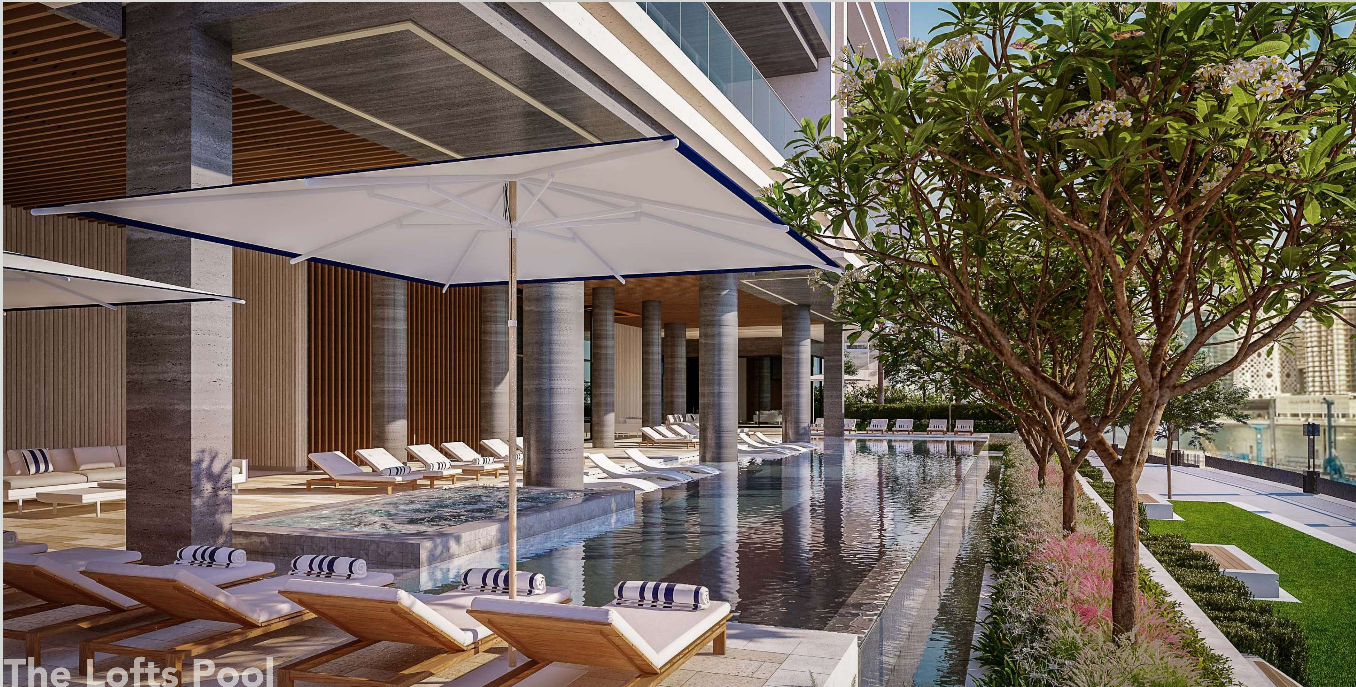
The Lofts Pool