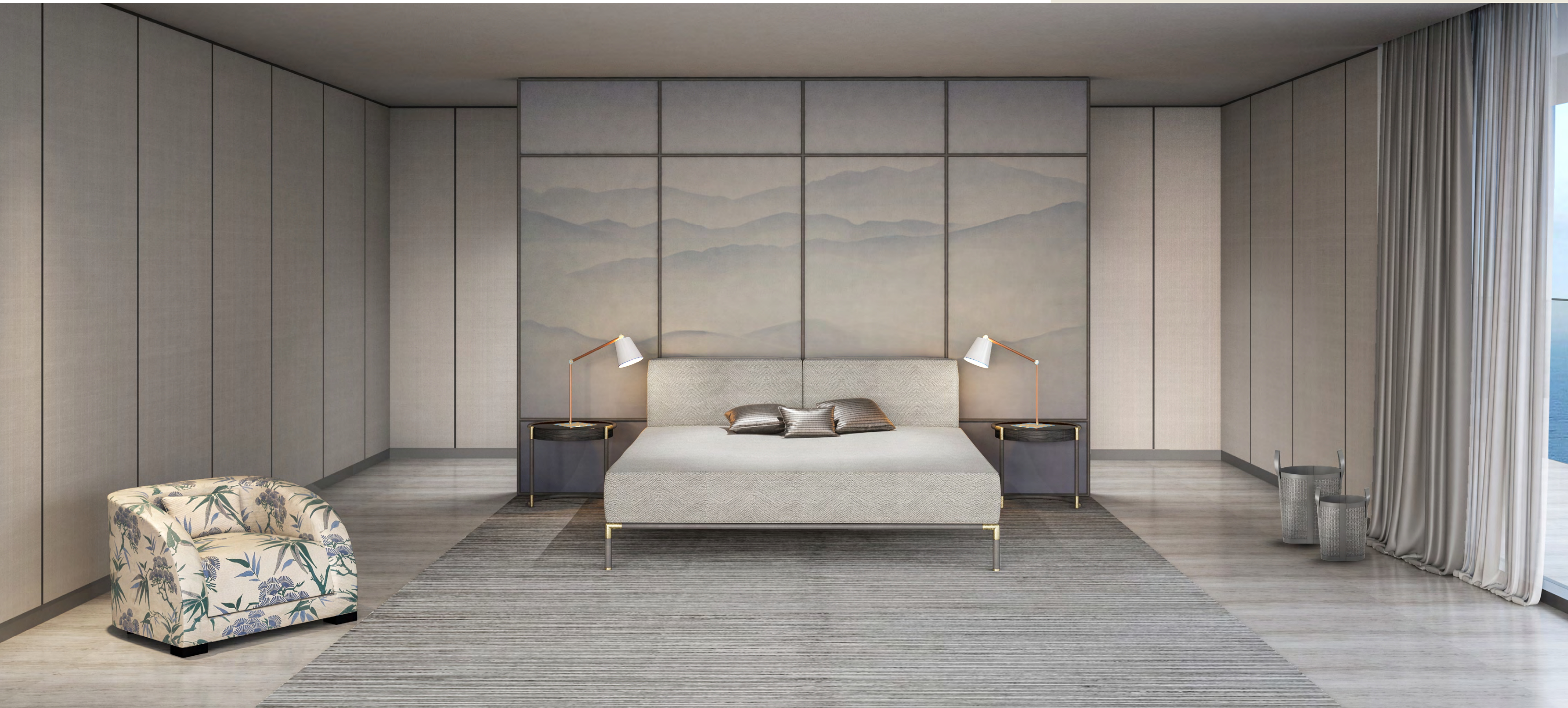
Five Bedroom Type Penthouse 3 - Unit Plan