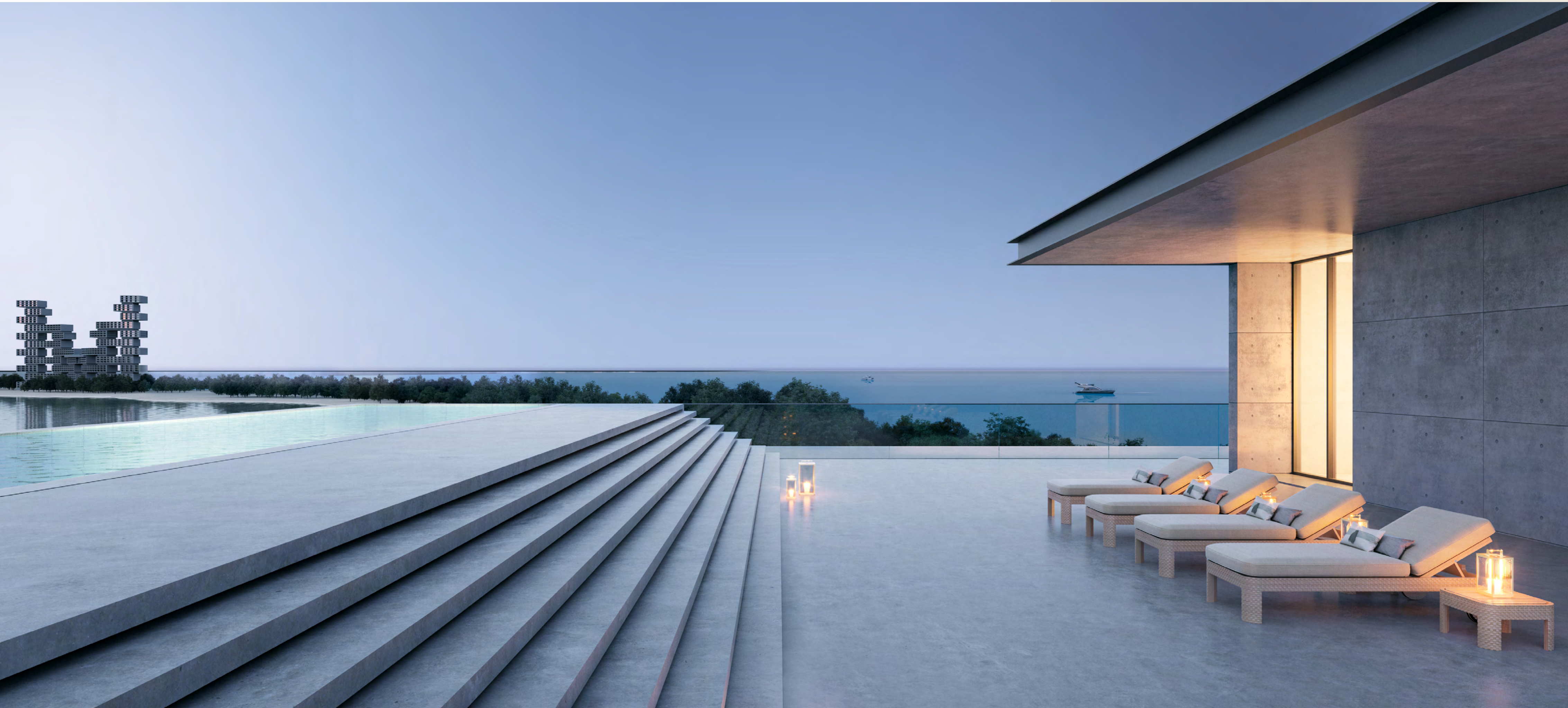
Presidential Suite 1 First Floor - Unit Plan