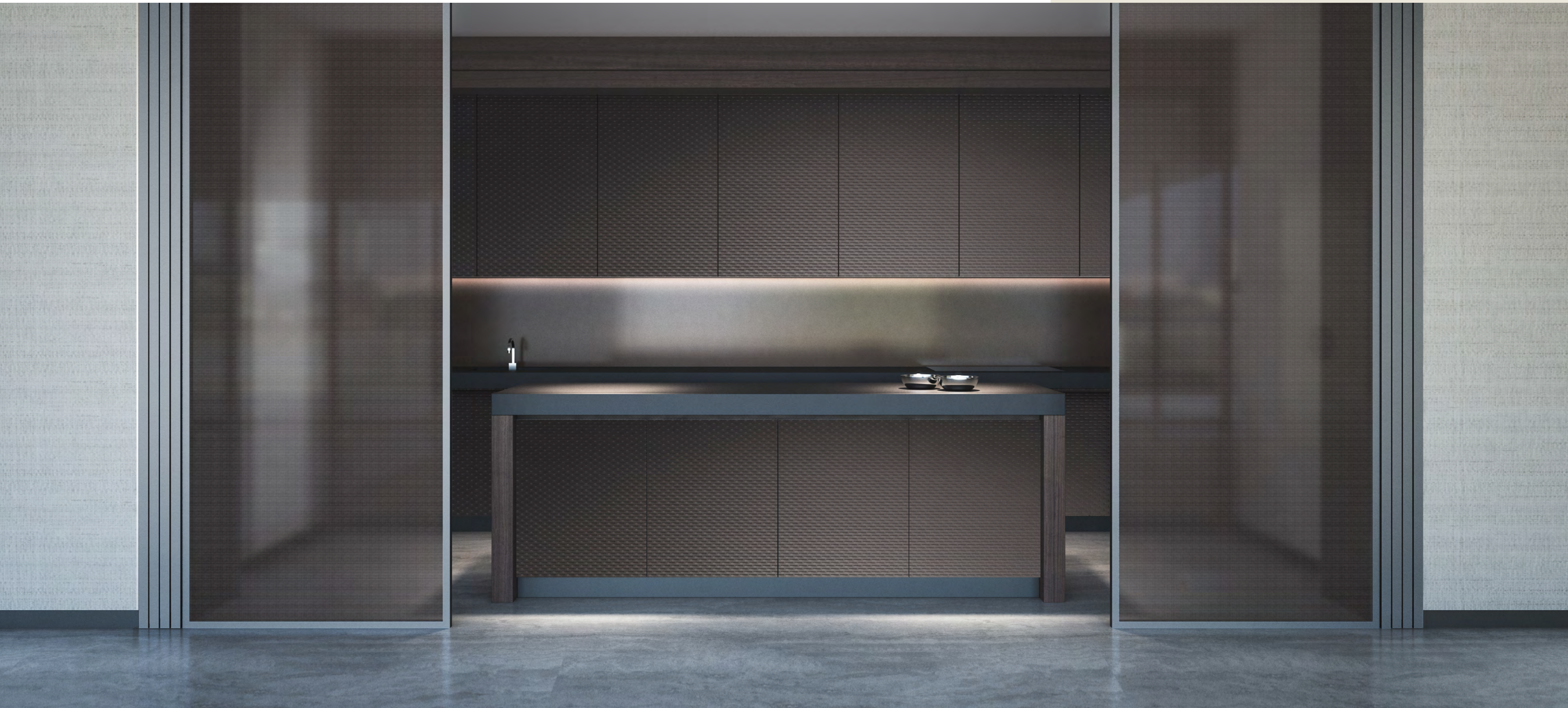
Five Bedroom Type Penthouse 2 - Unit Plan