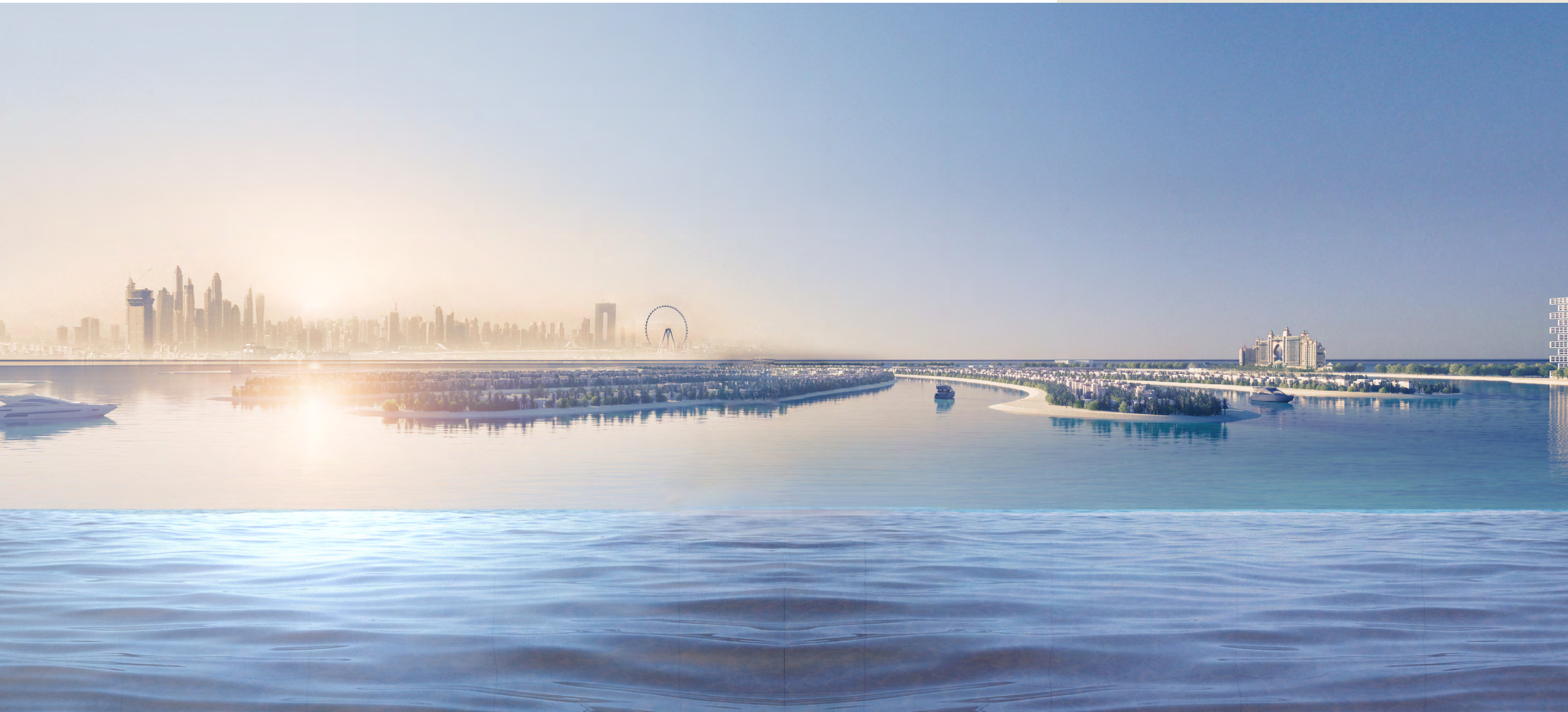
Presidential Suite 2 First Floor - Unit Plan