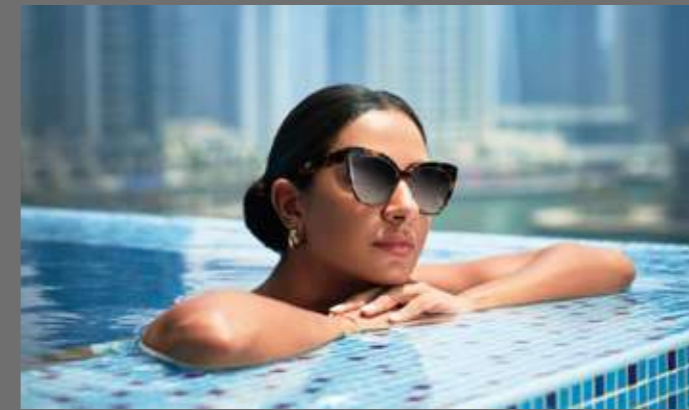
Lifestyle & Experiences