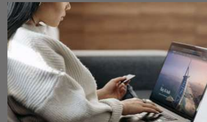
Pay with Points