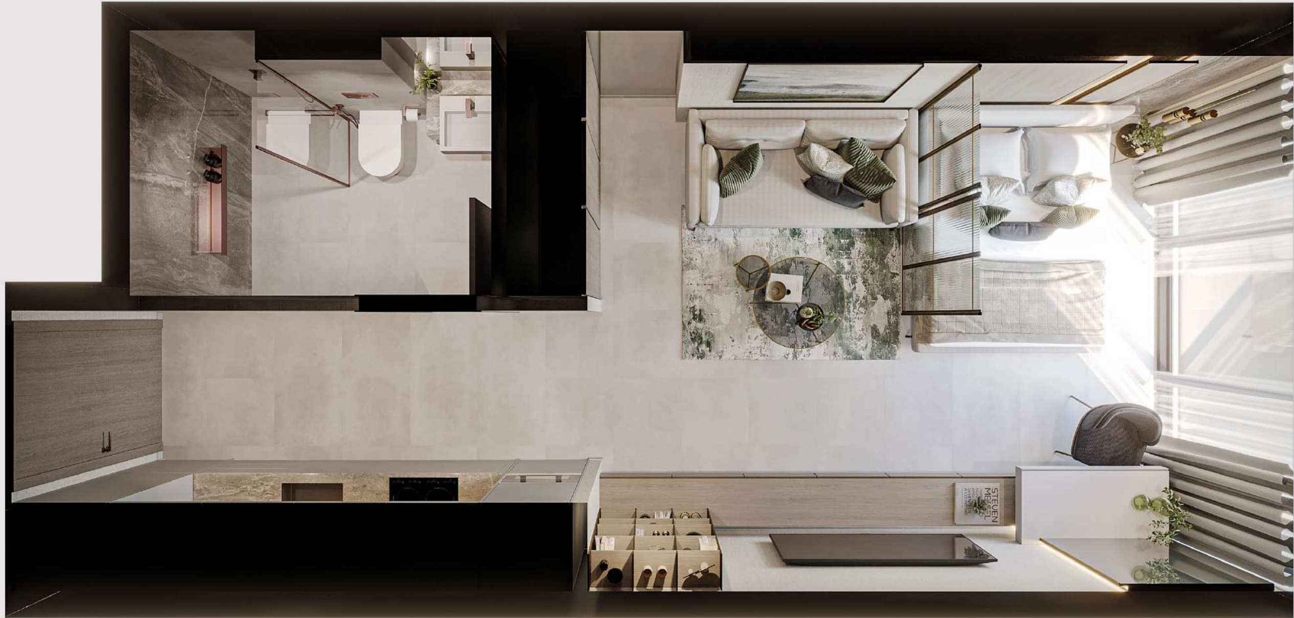
FLOOR PLAN TYPE A