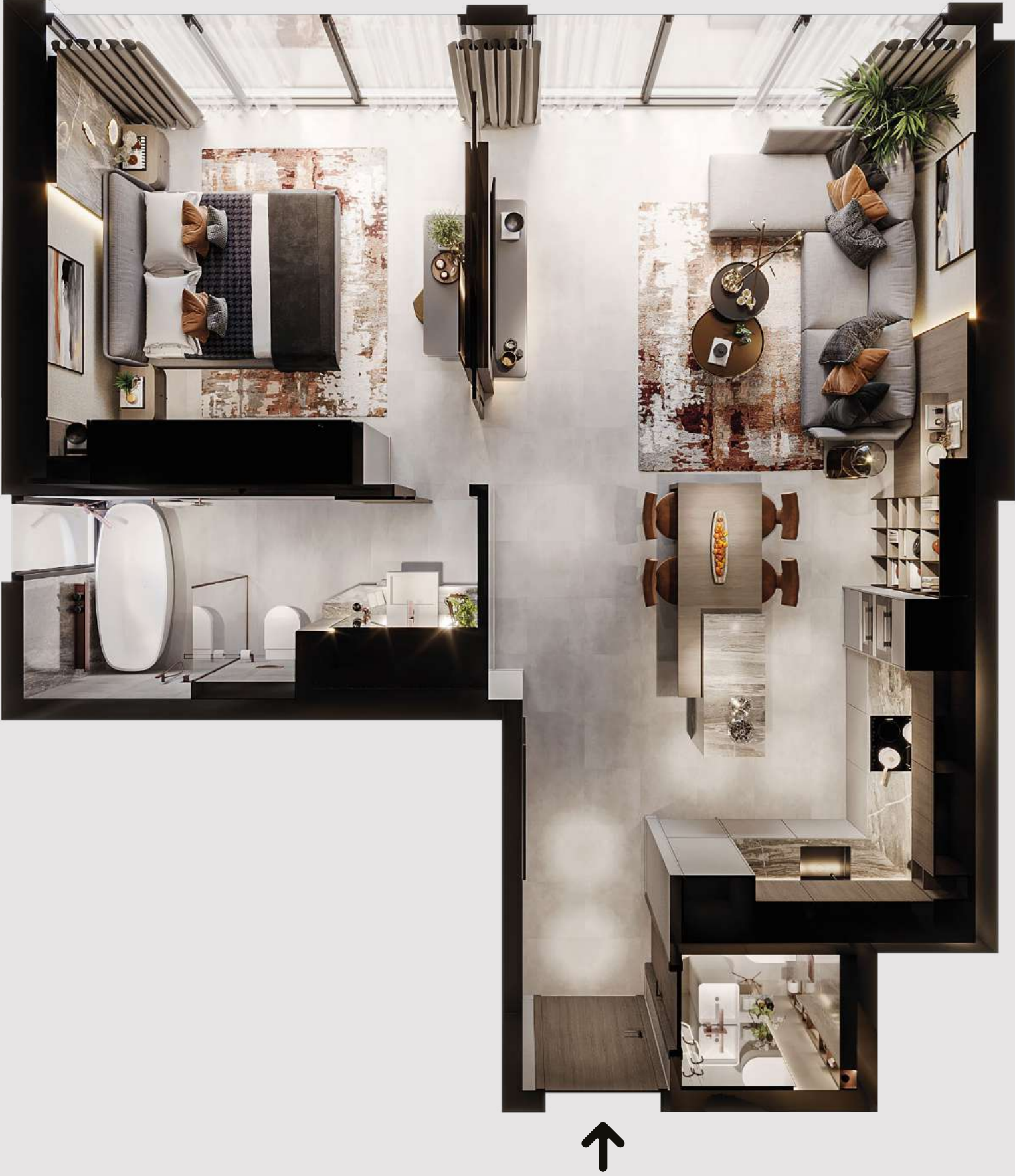
FLOOR PLAN TYPE E