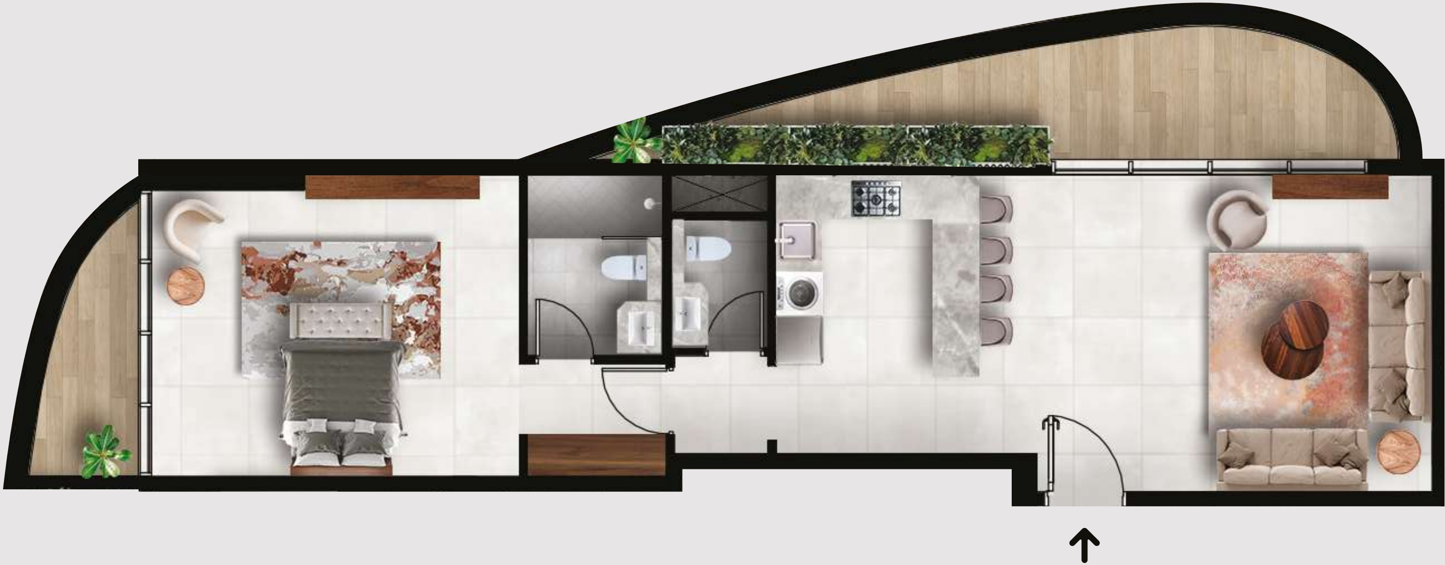
FLOOR PLAN TYPE B