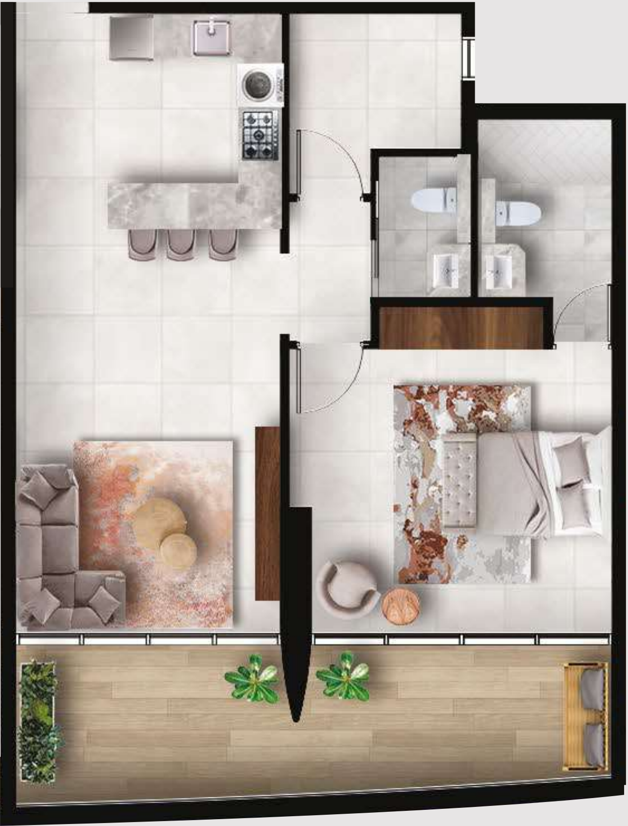
FLOOR PLAN TYPE D