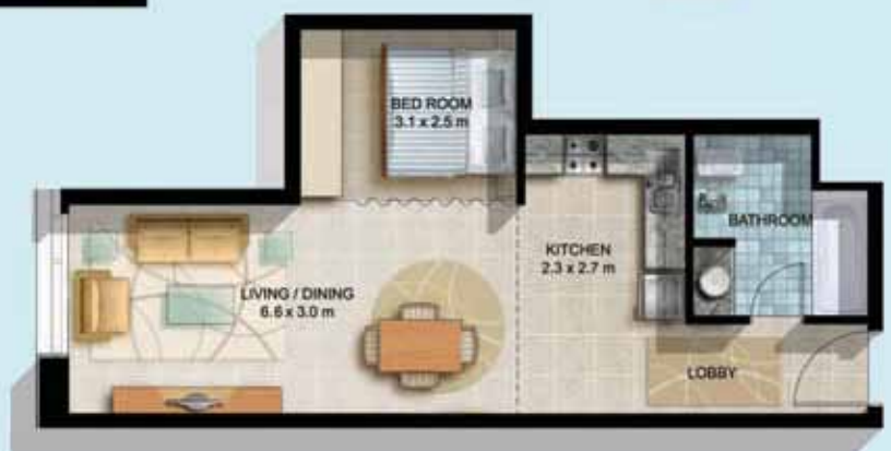
Type C One Bedroom Apt. 52.27 sq.mt 562.62 sq.ft Apt. Nos. 3 & 10