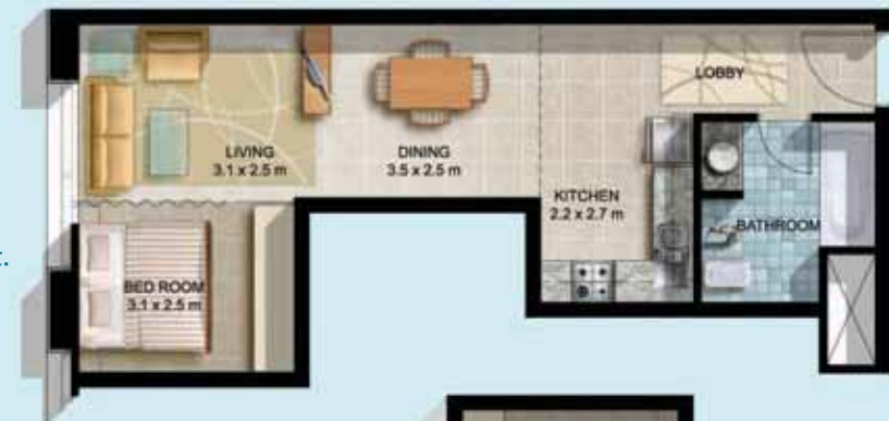
Type D One Bedroom Apt. 49.51 sq.mt 532.91 sq.ft Apt. Nos. 4 & 9