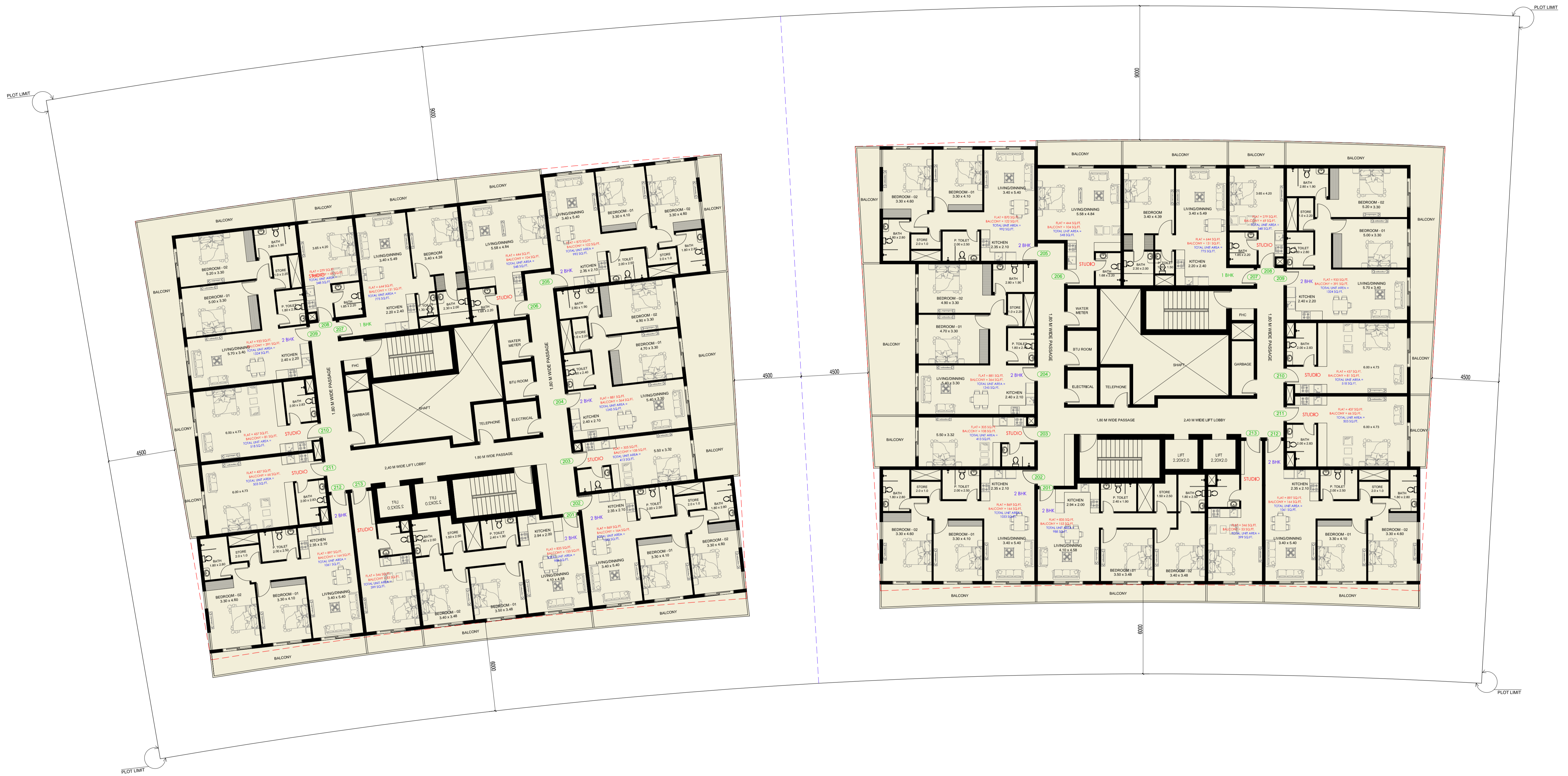
PROPOSED BUILDING (G+ 4+ ROOF)