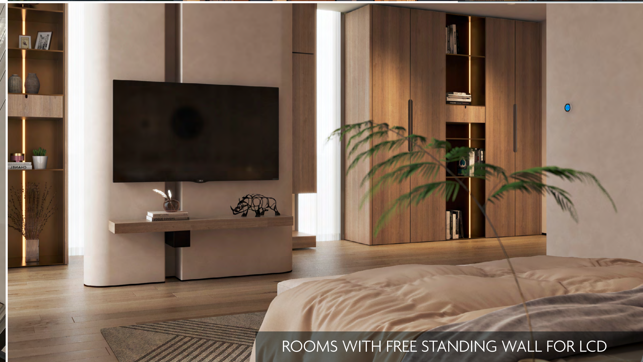
ROOMS WITH FREE STANDING WALL FOR LCD