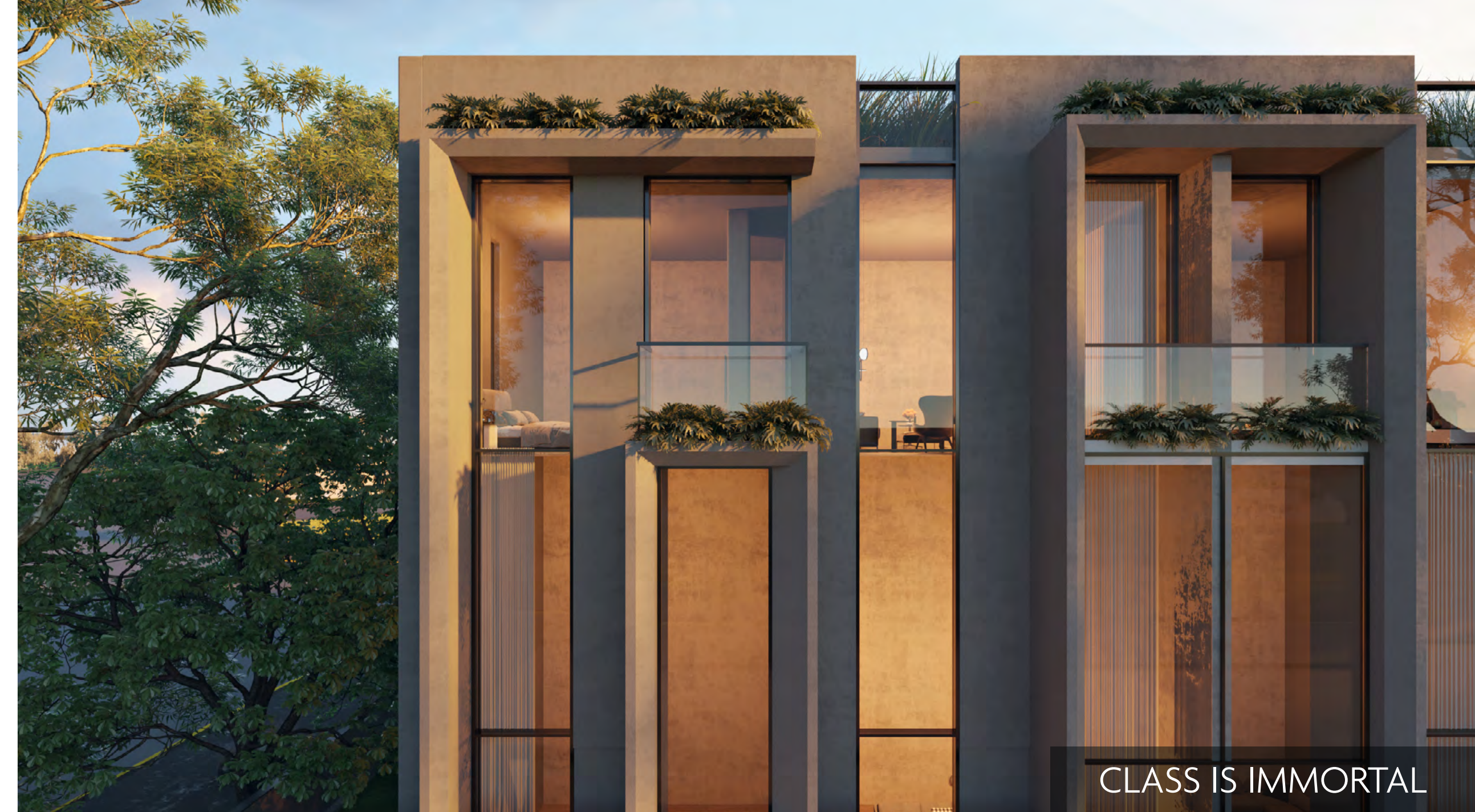
CLASS IS IMMORTAL