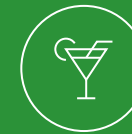
Cafe & Juice Bar