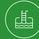
Infinity Swimming Pool

Meticulous attention to detail has been paid to every aspect of the building to make it the most desirable and convenient place to stay either short-term or long-term.