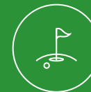
Open-Air Golf Simulator