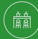
Restaurants & Cafe