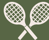
Squash & Tennis Court