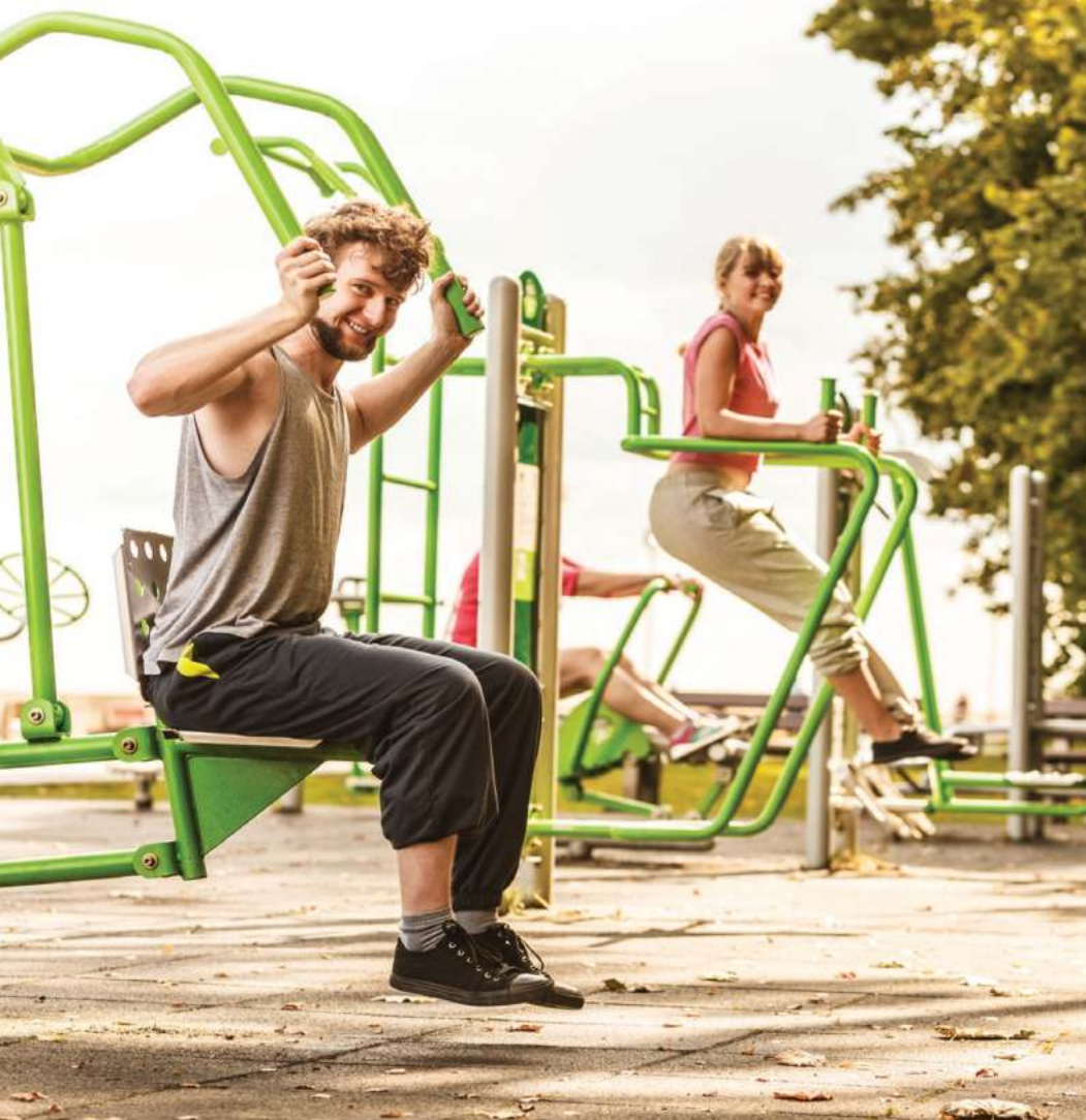
Outdoor Gym Terrace