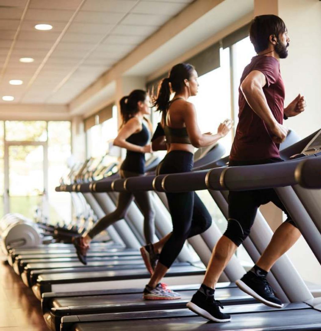
Health Club with changing rooms