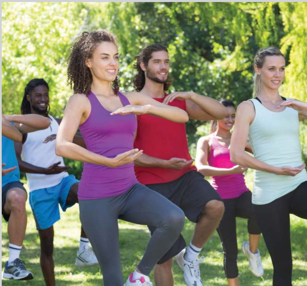
Tai Che Terrace