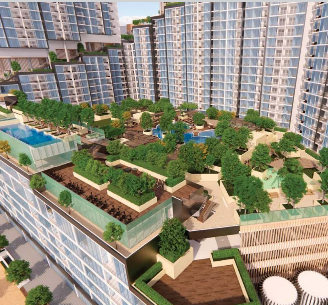
Landscaped Terraces at different levels with a host of amenities