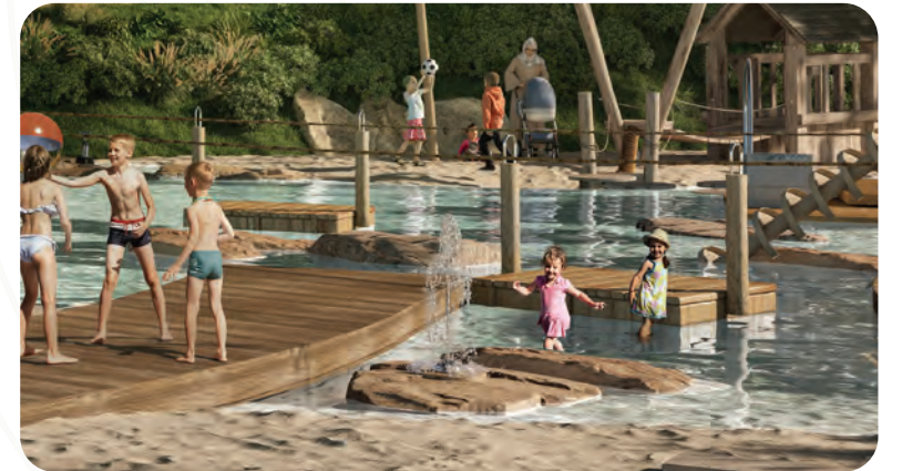
Swimming pools, splash pads and kids' play areas