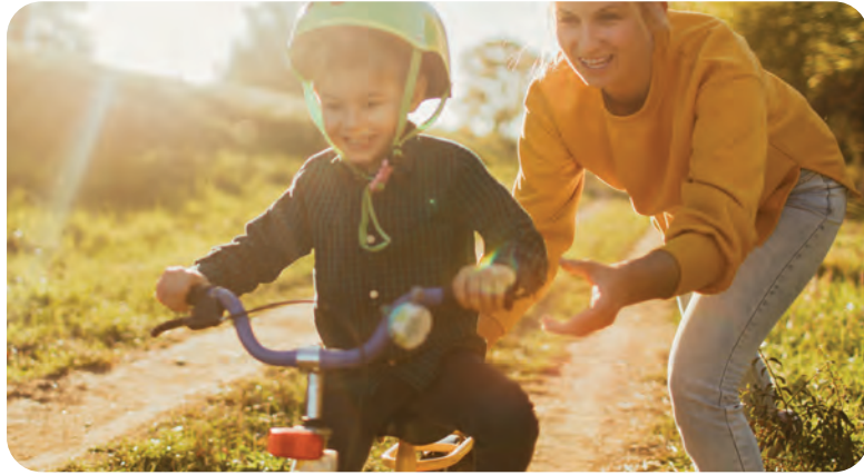
4.5 km of pedestrian tracks and 5.2 km of cycling trails