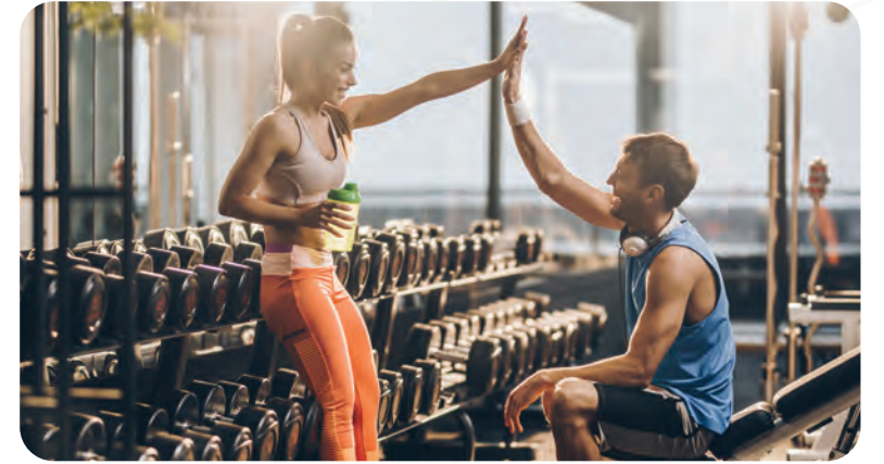
Gyms, outdoor wellness and fitness areas