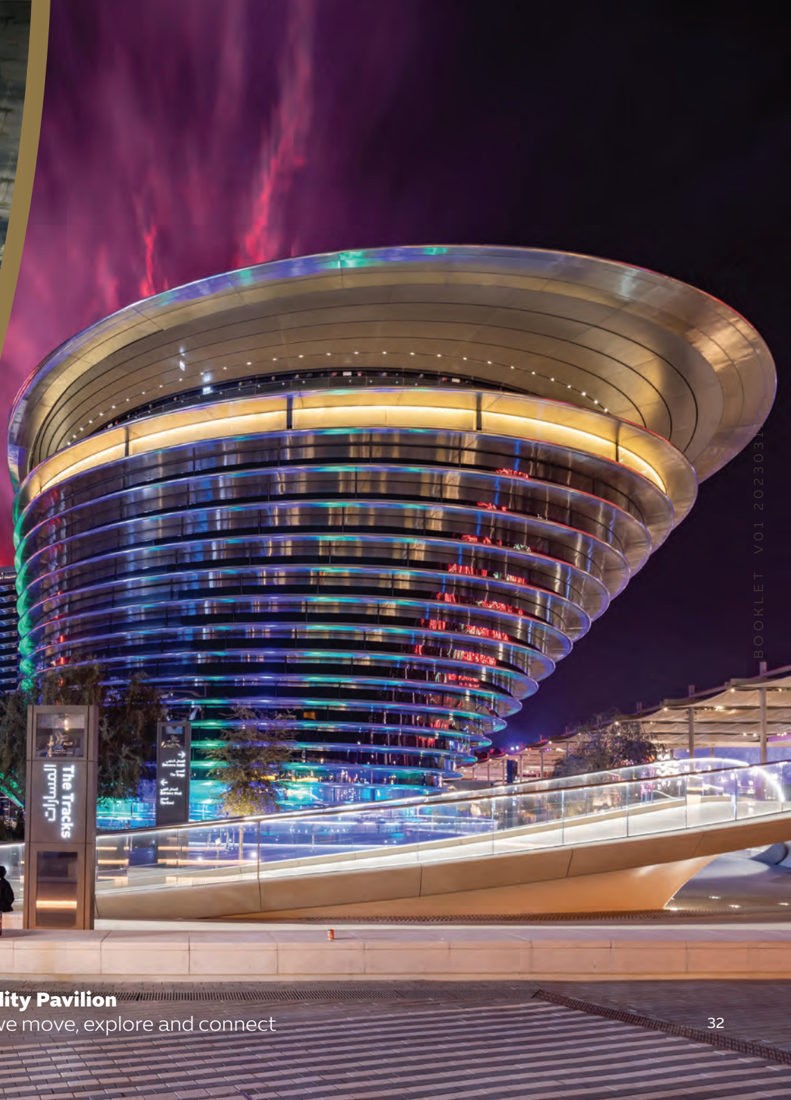
Alif – The Mobility Pavilion Exploring how we move, explore and connect