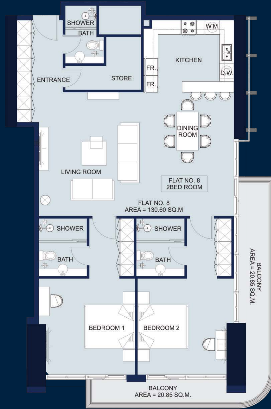
2 BHK - Residential Apartment - Unit 8 5th to 16th Floor