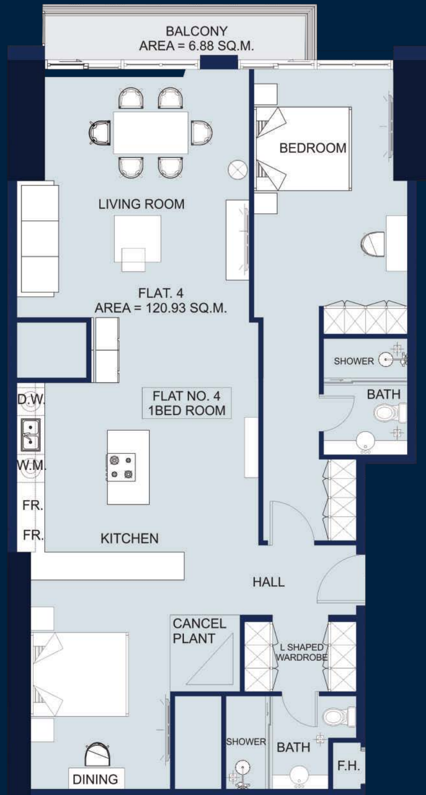
1 BHK + GR - Residential Apartment - Unit 4 5th to 16th Floor