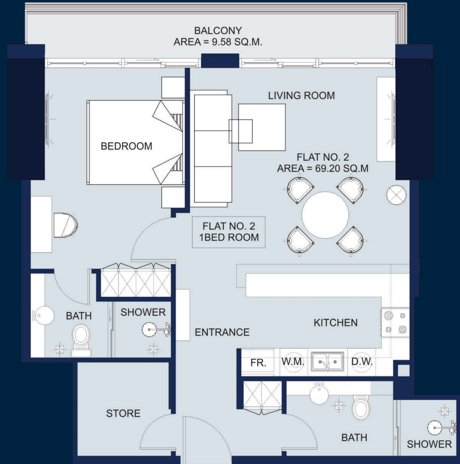
1 BHK - Residential Apartment - Unit 2 5th to 16th Floor