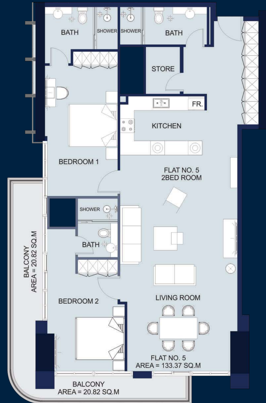
2 BHK - Residential Apartment - Unit 5 19th to 25th & 28th to 34th Floor