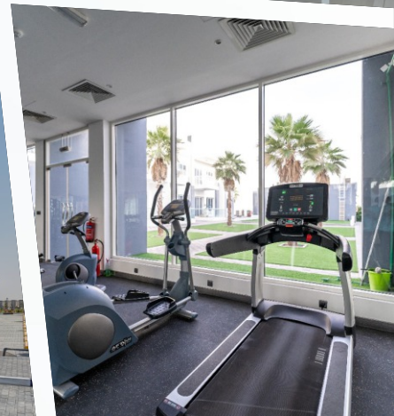
Actual Site Images