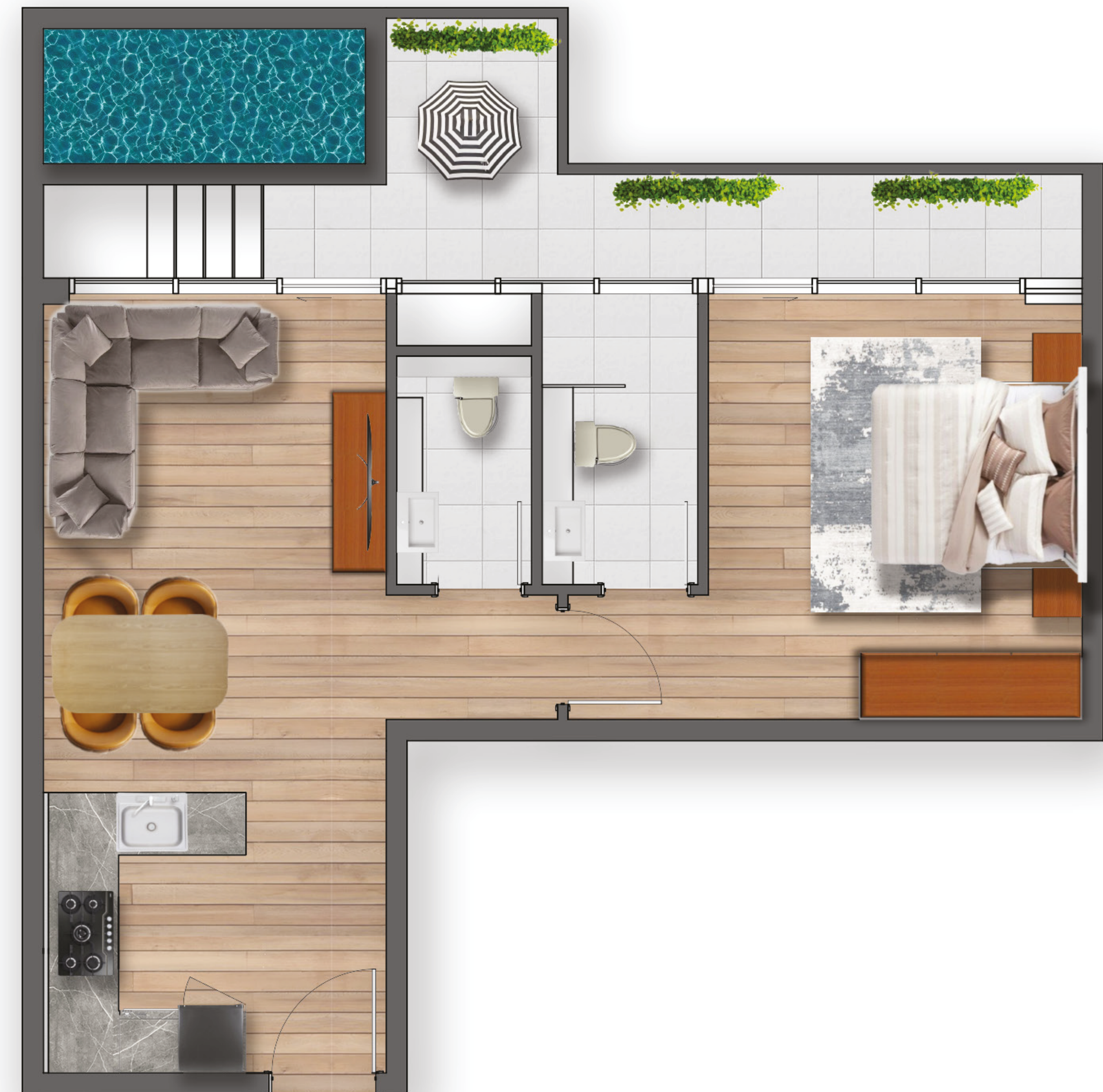
ONE BEDROOM WITH PRIVATE POOL