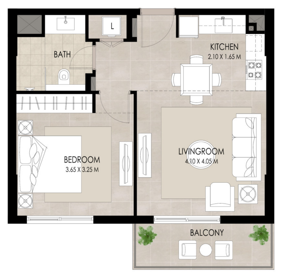
*Balcony sizes vary