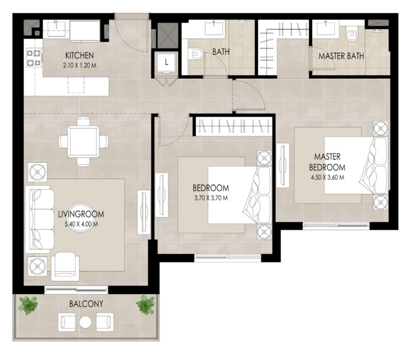
*Balcony sizes vary