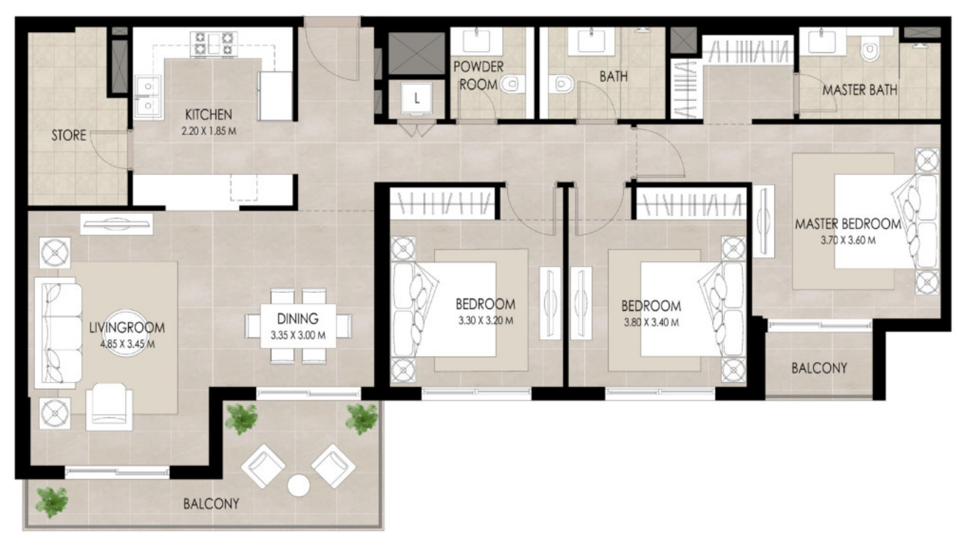
*Balcony sizes vary

SUITE AREA 123.13 Sq.m / 1325.36 Sq.ft BALCONY AREA 18.67 Sq.m / 200.96 Sq.ft TOTAL BUILT-UP AREA 141.80 Sq.m / 1526.32 Sq.ft