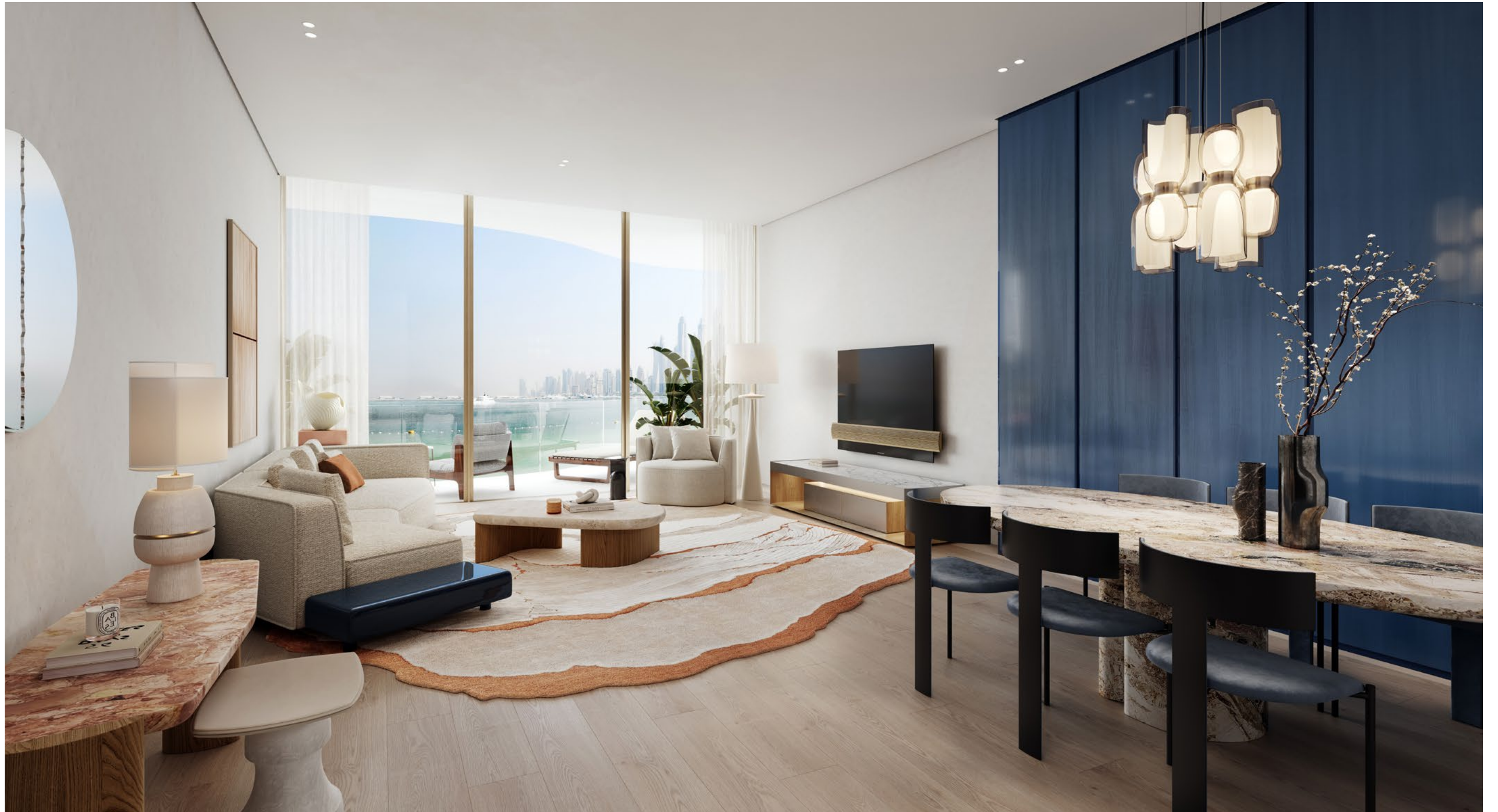
Dining and living area