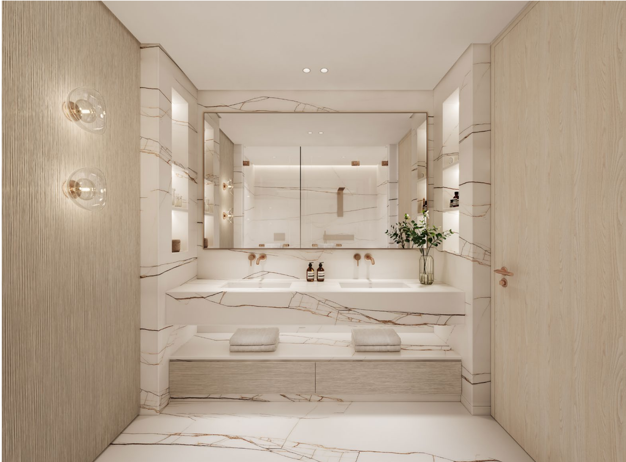
Bathrooms adorned with impeccable textures and fine finishes