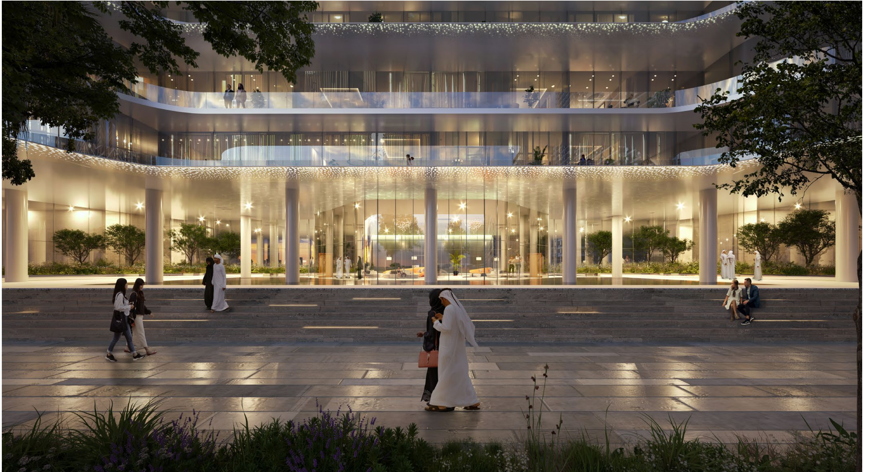
Glass façades, large terraces, and epic panoramas create an expansive sense of space