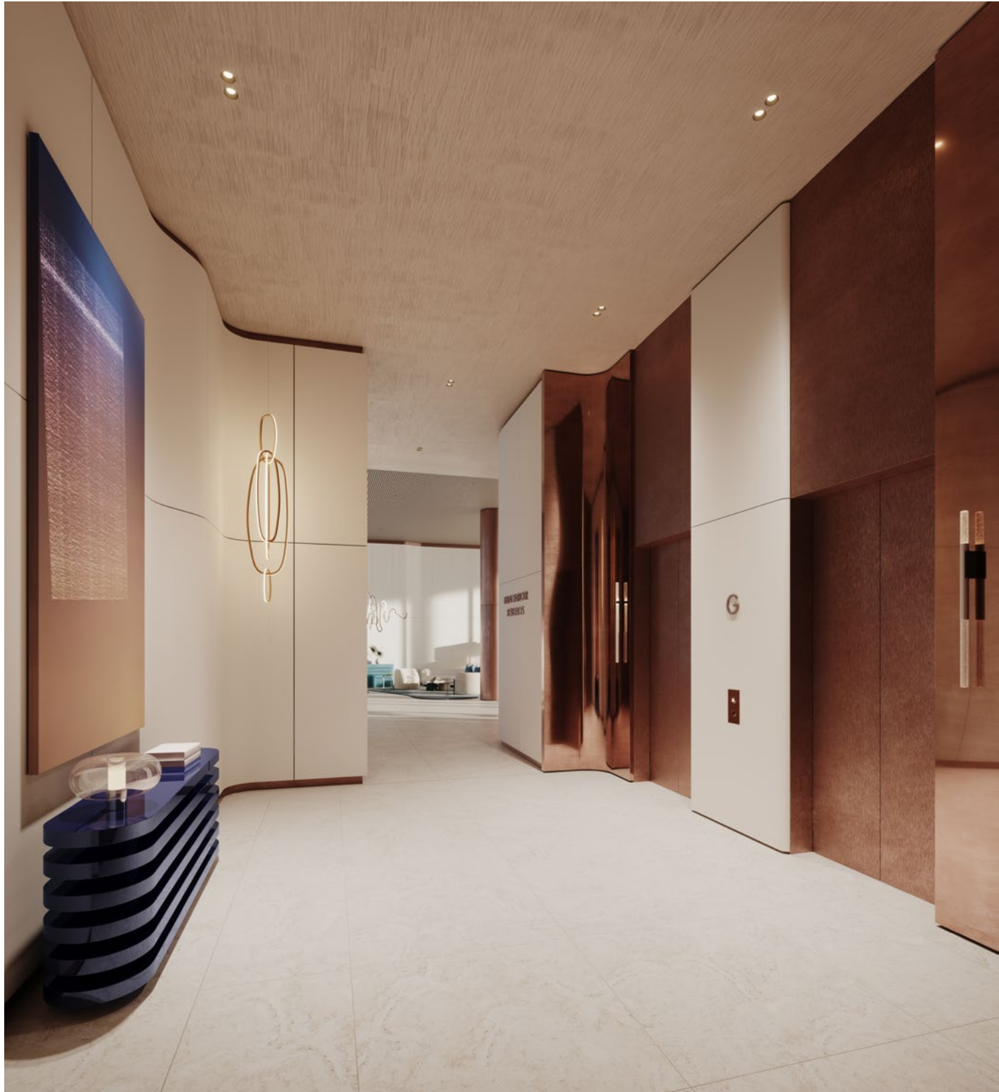
Lift lobby area