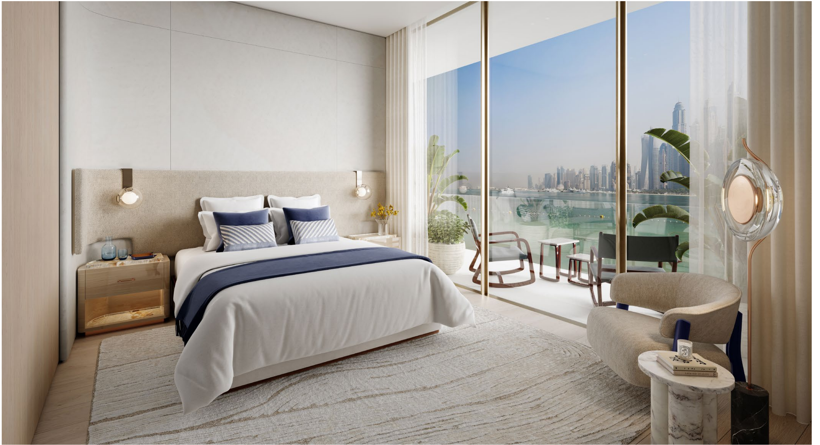
Panoramic bedroom views of the sands, sea, and city