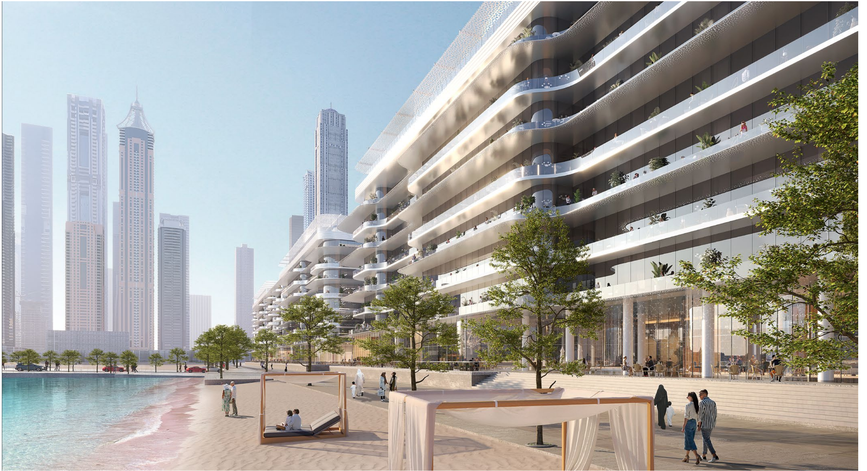
Dubai Harbour Residences provides instant access to the beach