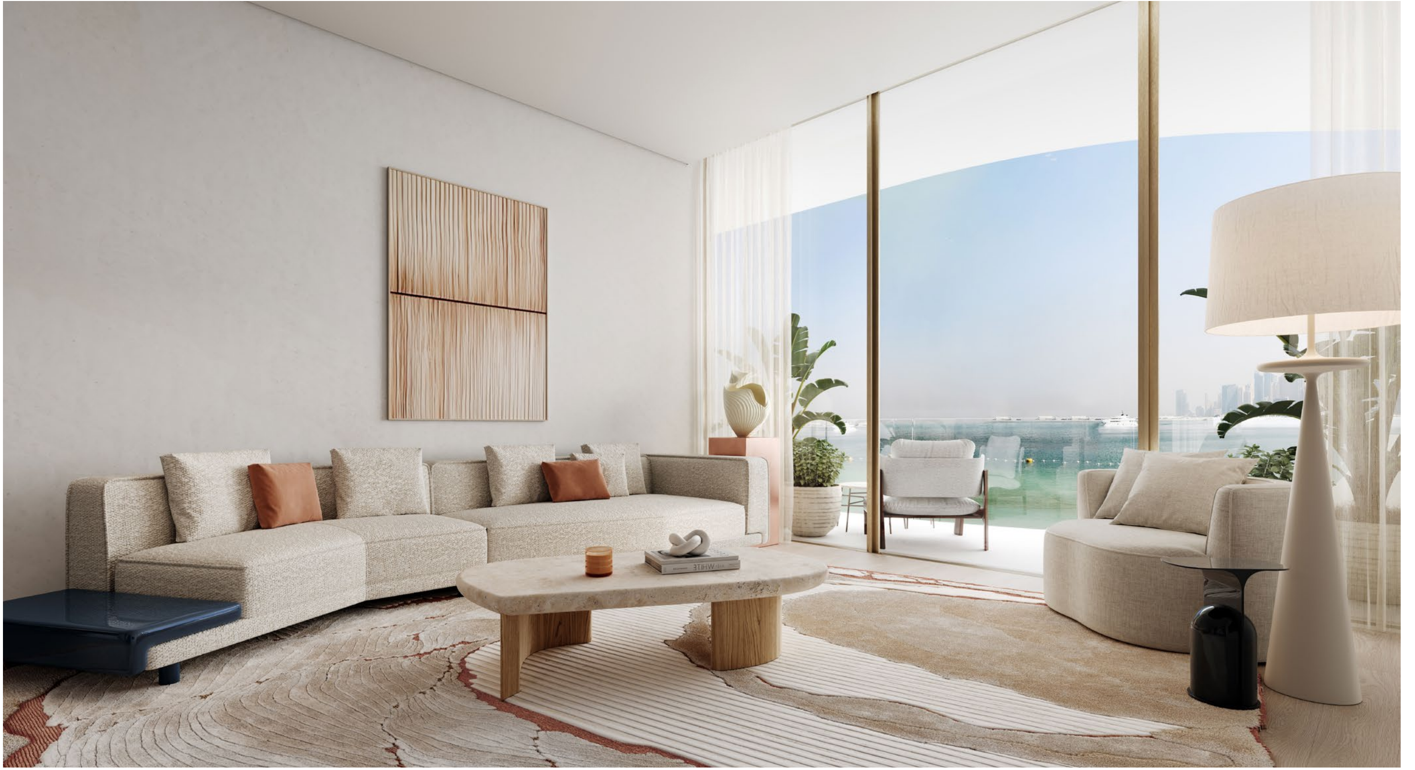
A space to indulge in moments of relaxation and comfort