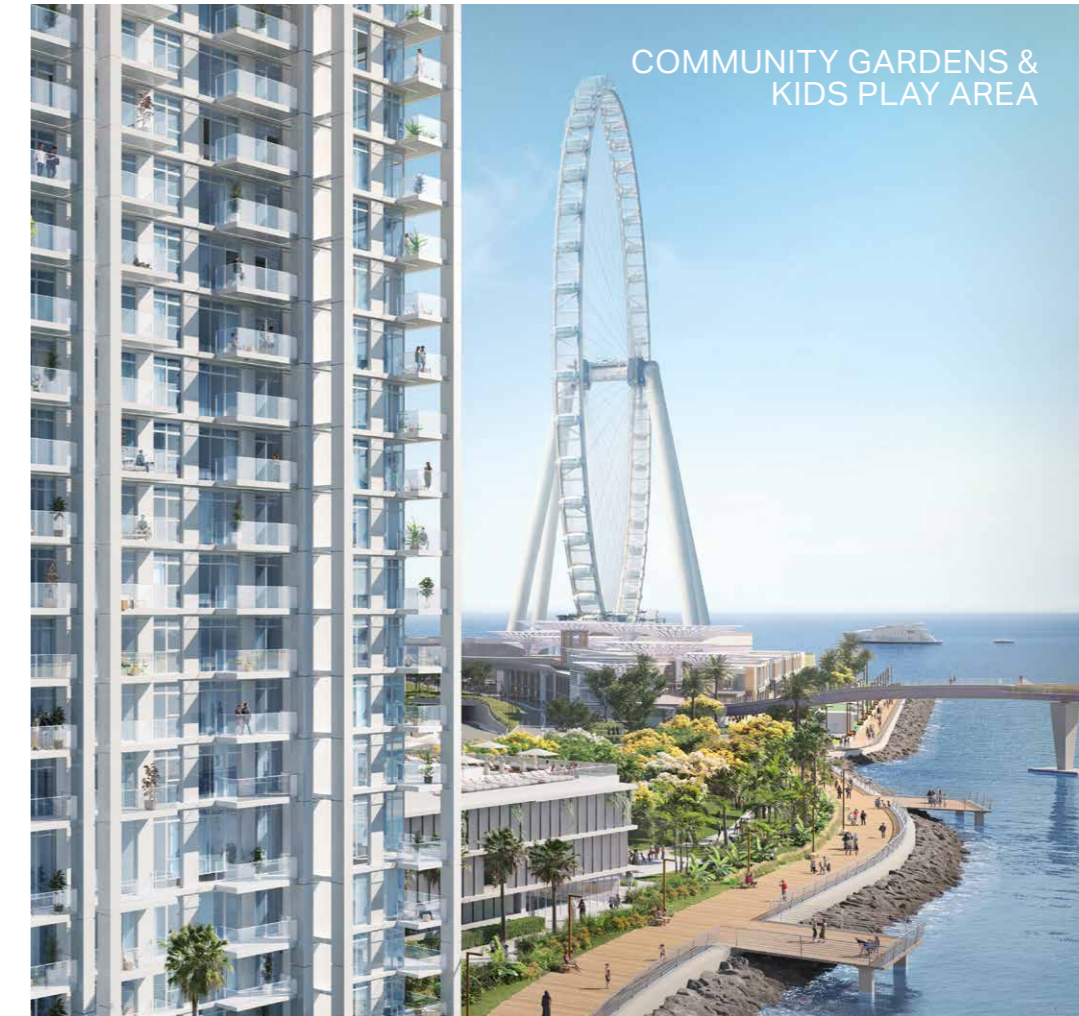
COMMUNITY GARDENS & KIDS PLAY AREA