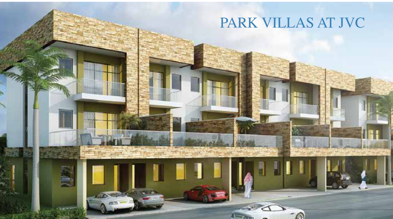
PARK VILLAS AT JVC