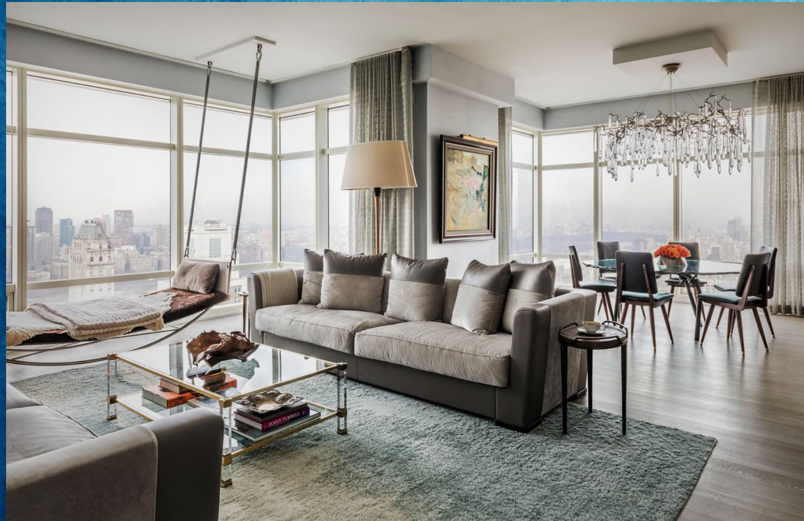
Lexington Avenue, New York.