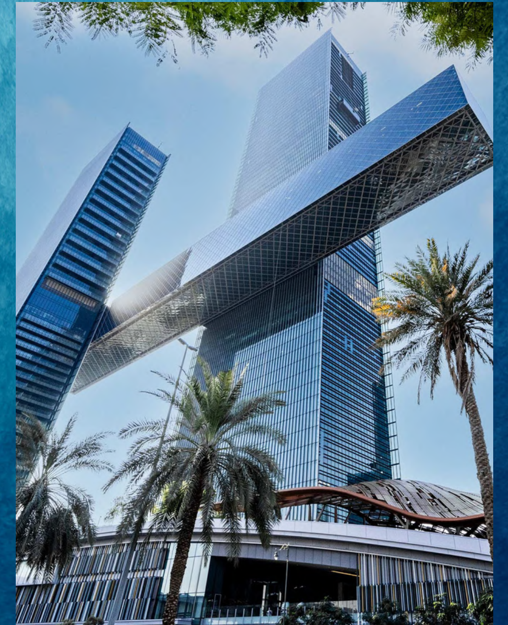
One & Only One Za'abeel, Dubai