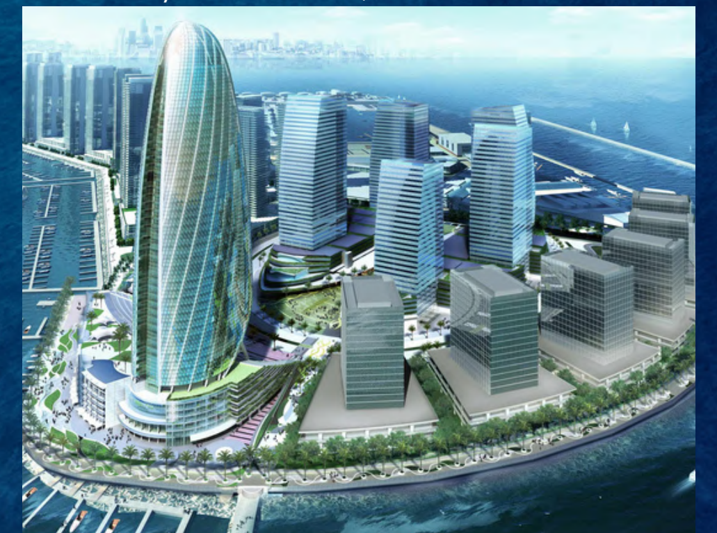
Dubai Maritimes City Landmark Tower