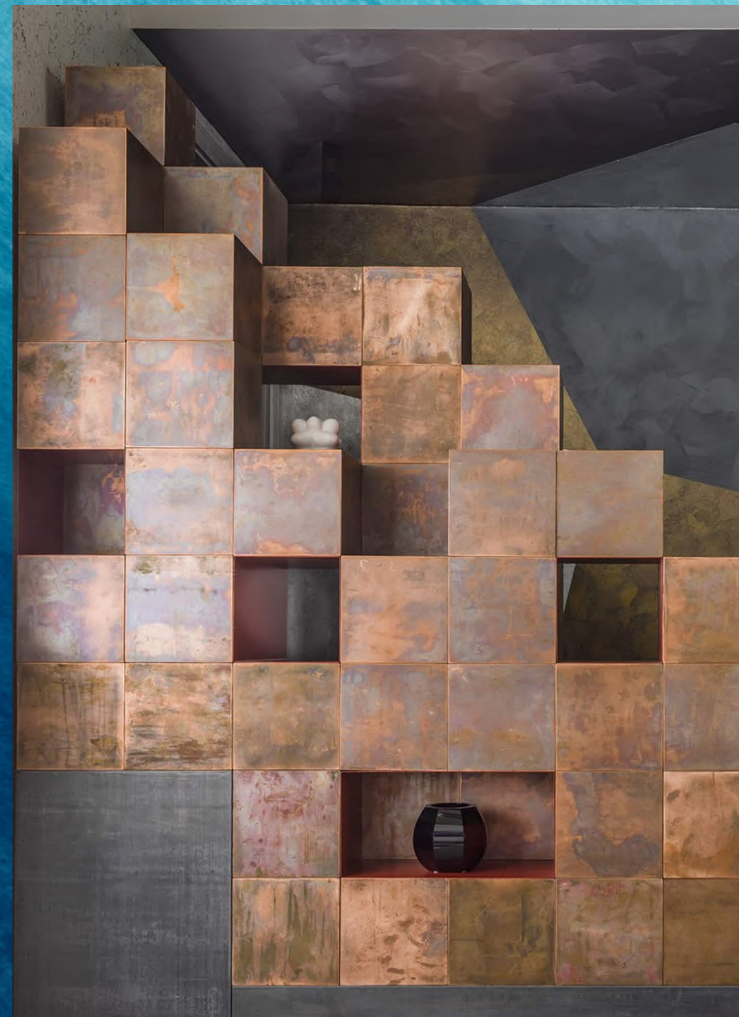
Lexington Avenue, New York.