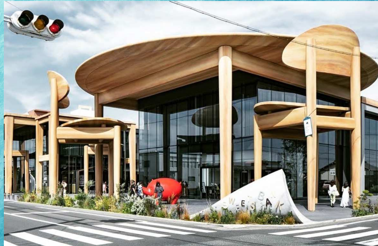
Sweets Bank, Hamamatsu City

The firm is credited to having helmed illustrious projects globally, such as Tokyo Tower, One & Only One Za'abeel, Tokyo Dome, Ritz Carlton Kyoto, Cairo Opera House, and now Sora Beach Residences Al Marjan Island, UAE.