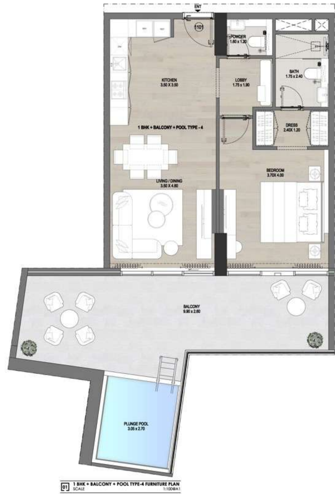
01 1 BHK + BALCONY + POOL TYPE-4 FURNITURE PLAN SCALE 1:100@A1