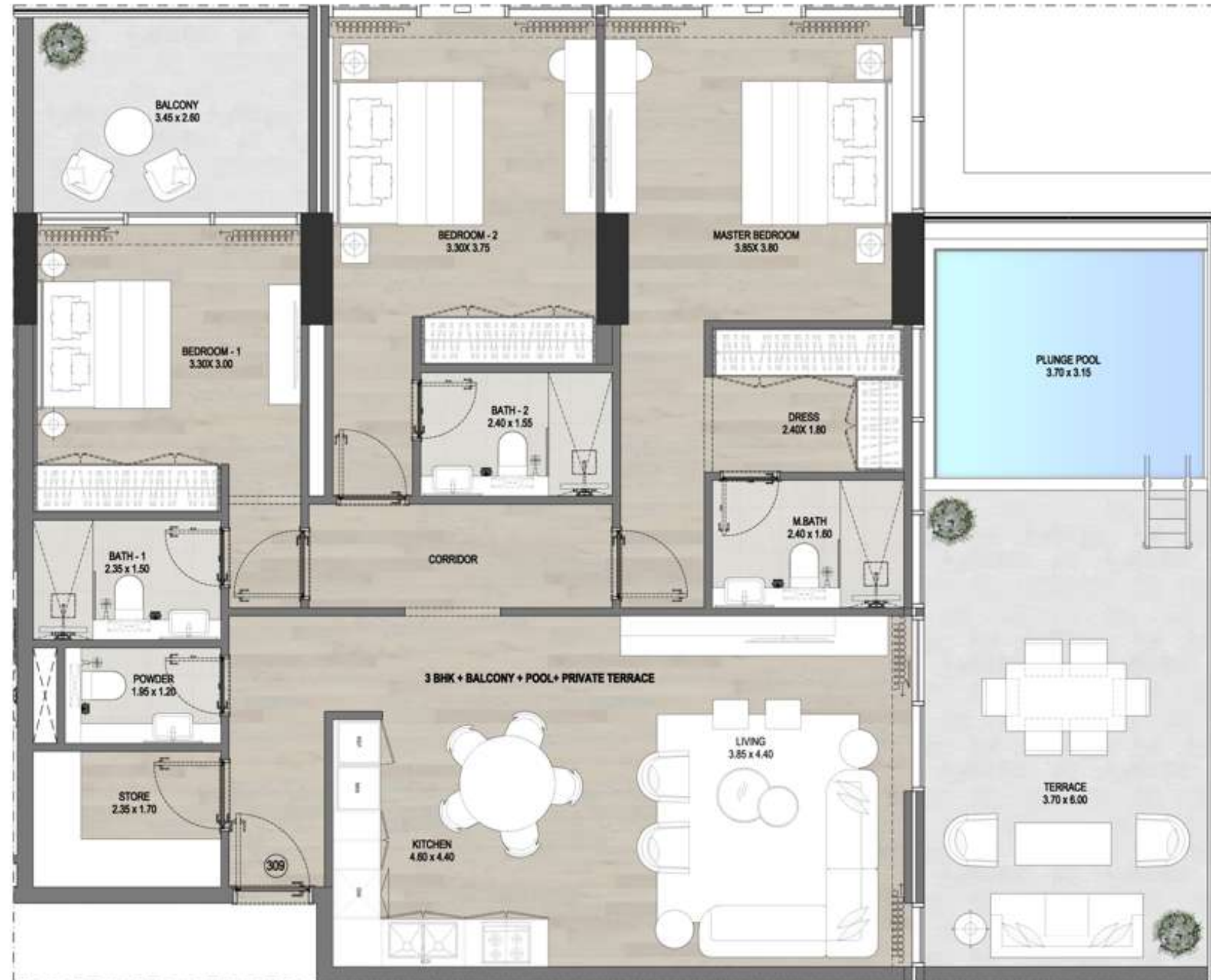
01 3 BHK + BALCONY + POOL + PRIVATE TERRACE FURNITURE PLAN SCALE 1:100@A1