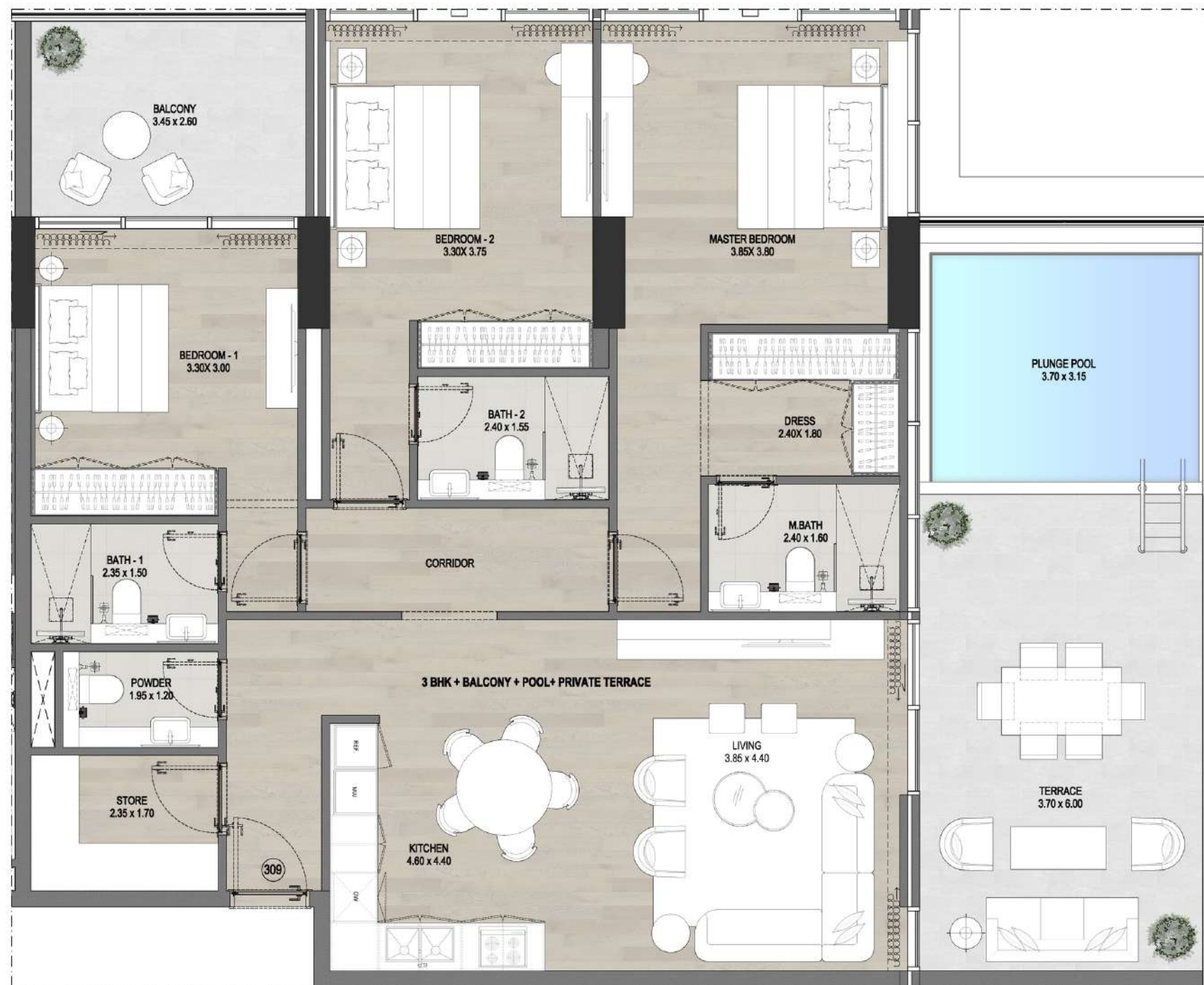
01 3 BHK + BALCONY + POOL + PRIVATE TERRACE FURNITURE PLAN SCALE 1:100@A1