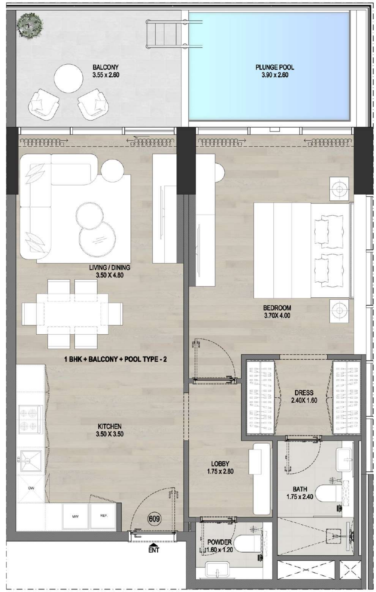
01 1 BHK + BALCONY + POOL TYPE-2 FURNITURE PLAN SCALE 1:100@A1