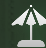
LA MER BEACH