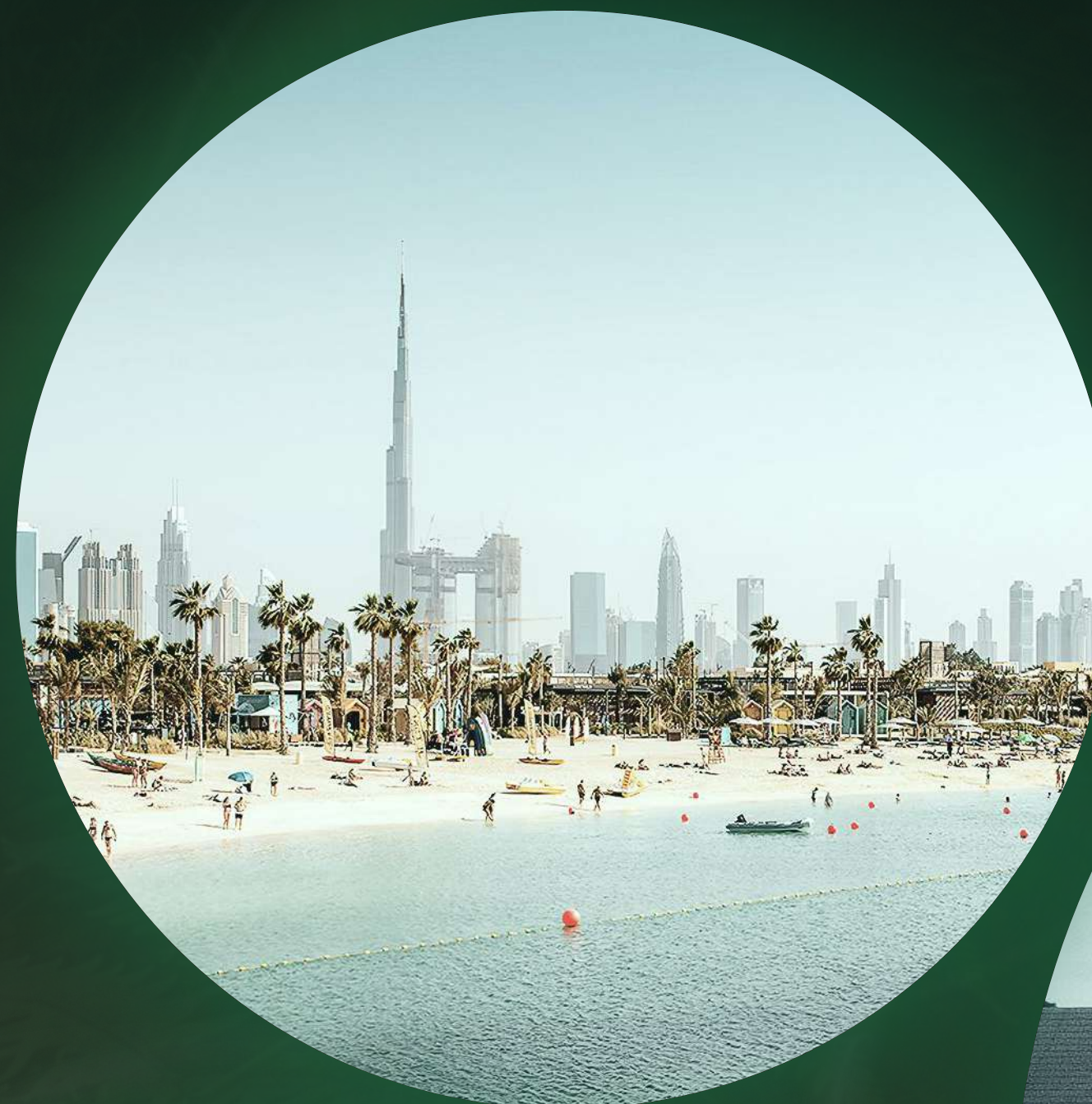
LA MER BEACH