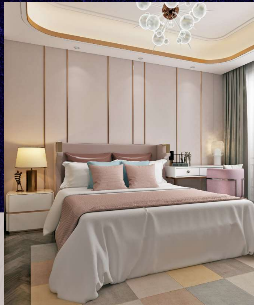
Early check-in/ Late check-out