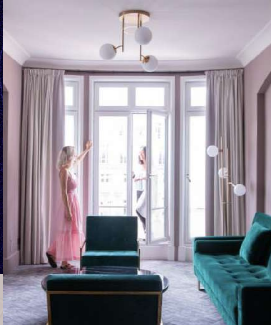
Room upgrades to the next category