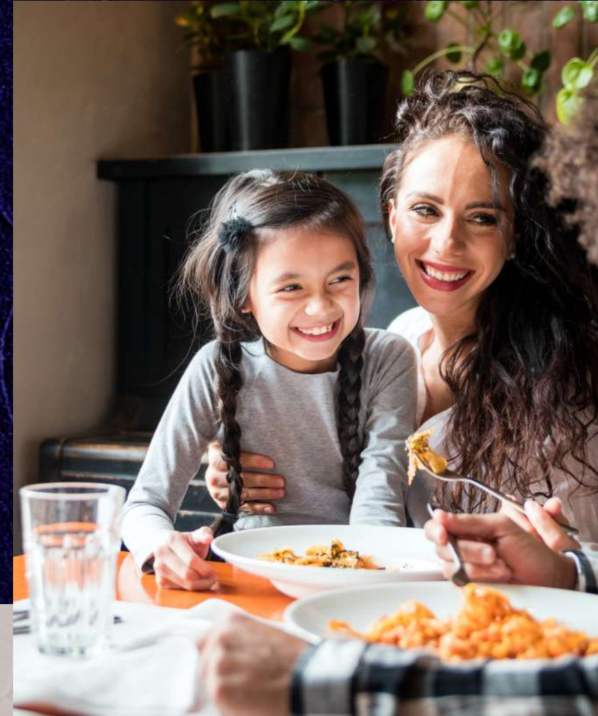
Kids eat free