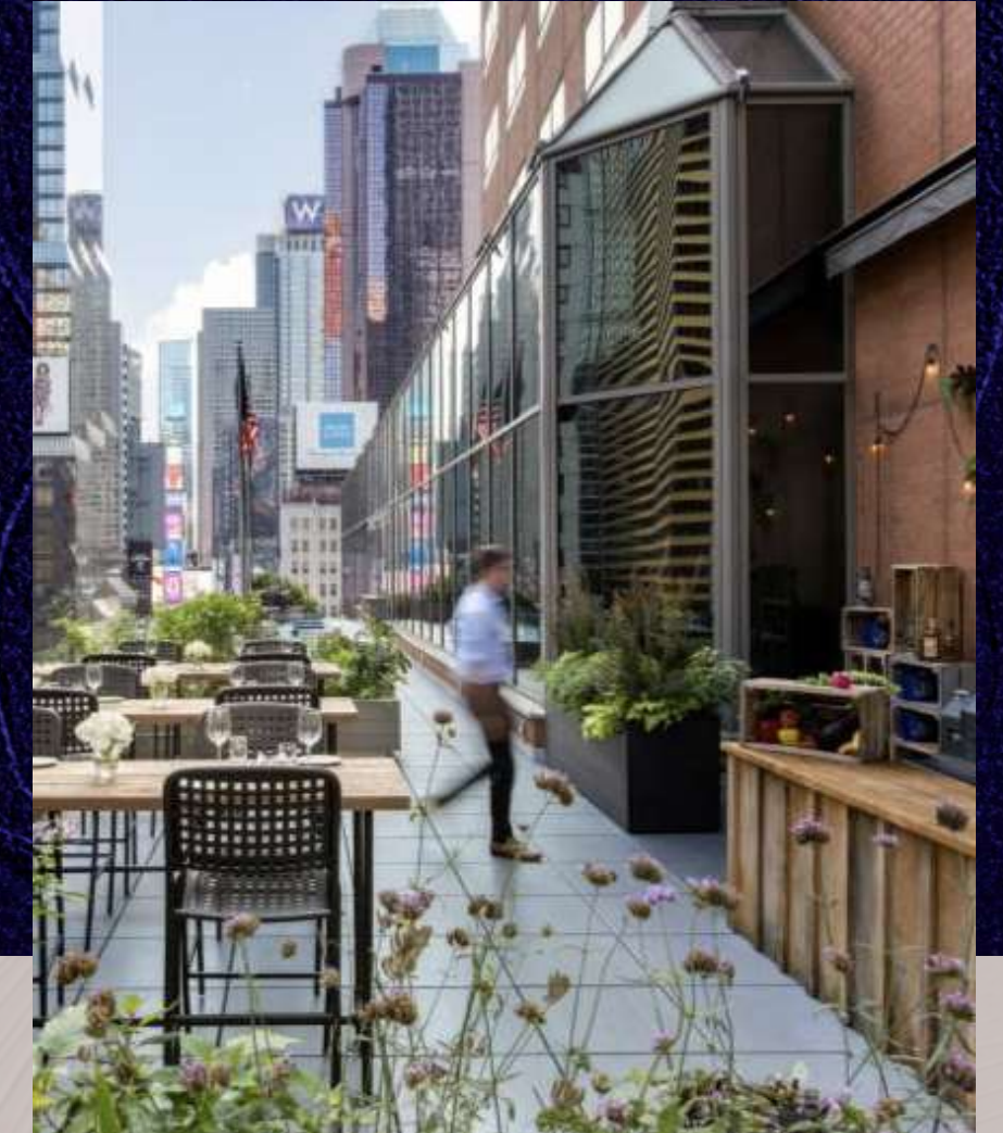
Exclusive invitations to Prestige events