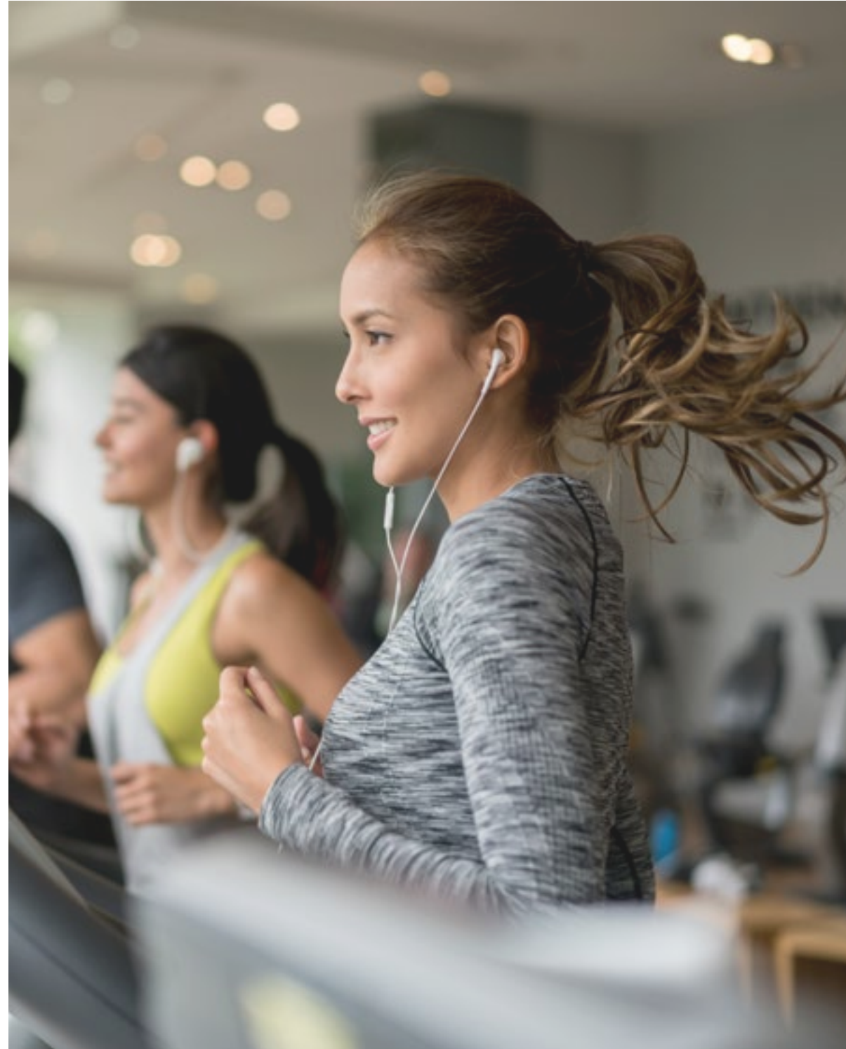
Indoor & Outdoor