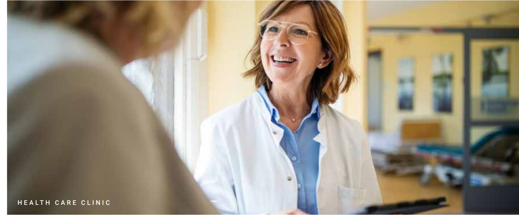
HEALTH CARE CLINIC