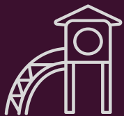
Kids Play Areas