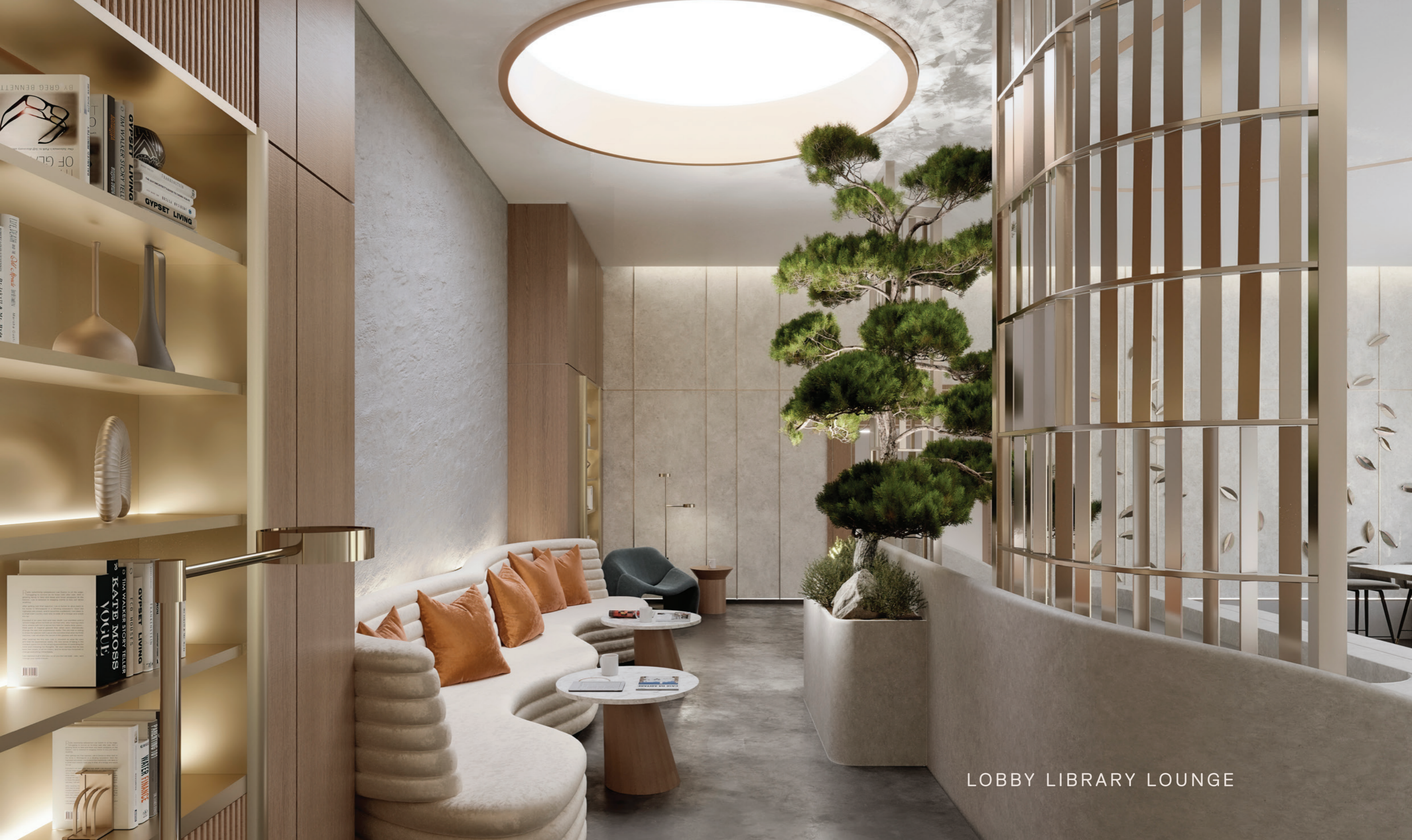
LOBBY LIBRARY LOUNGE