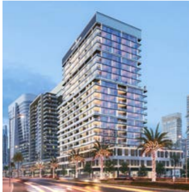
TRILLIONAIRE RESIDENCES BY BINGHATTI