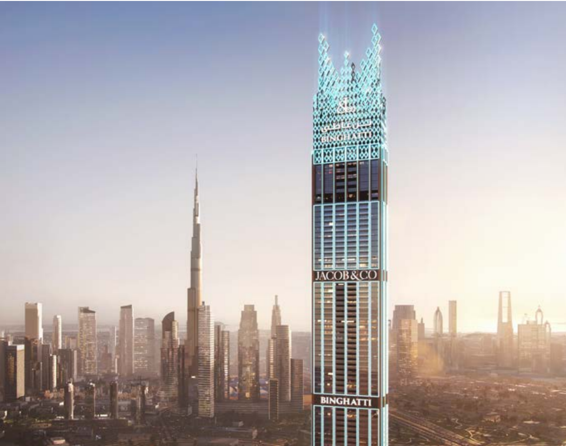
BURJ BINGHATTI JACOB & CO RESIDENCES