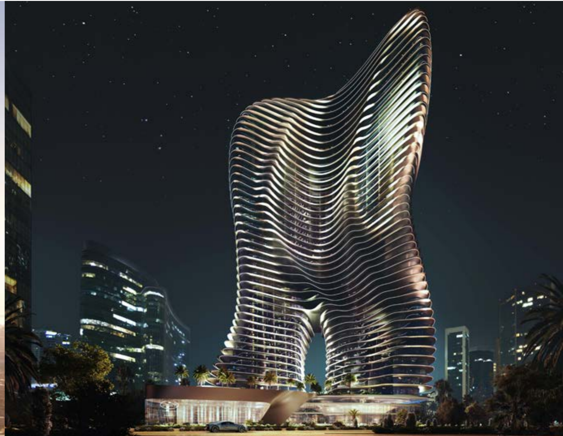
BUGATTI RESIDENCES BY BINGHATTI