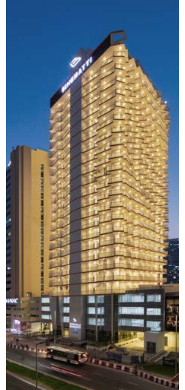
MILLENIUM BINGHATTI RESIDENCES