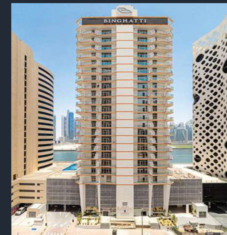
MILLENNIUM BINGHATTI RESIDENCE