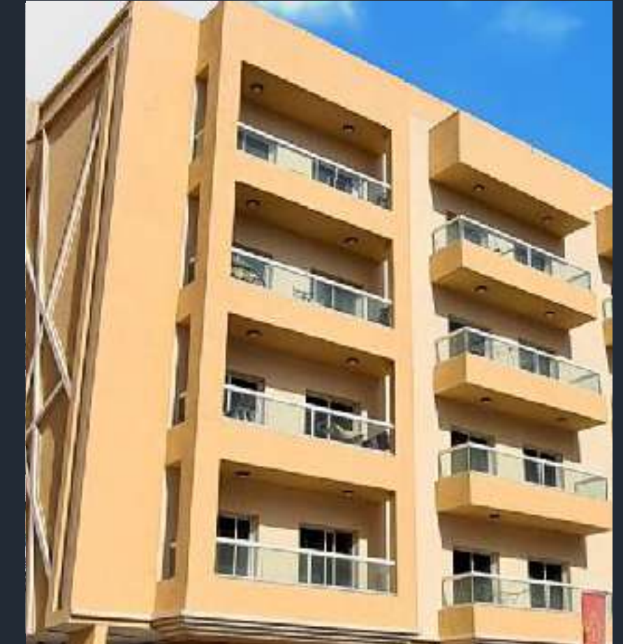
SMART TOWER 1